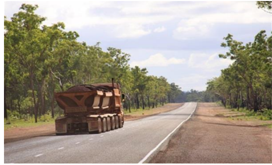
Ore truck on WDR haul road