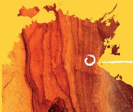
Roper Red Mine (Roper, NT)