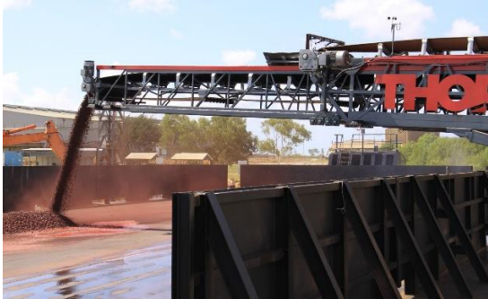
Loading first barge