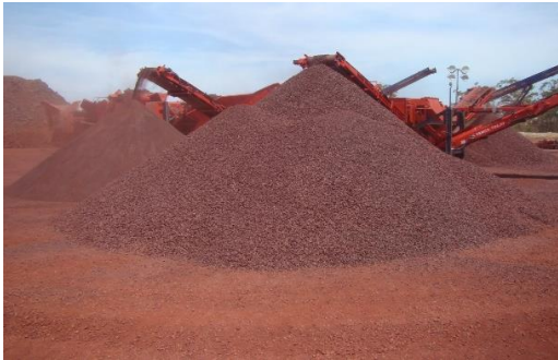
Crusher and ROM stockpiles