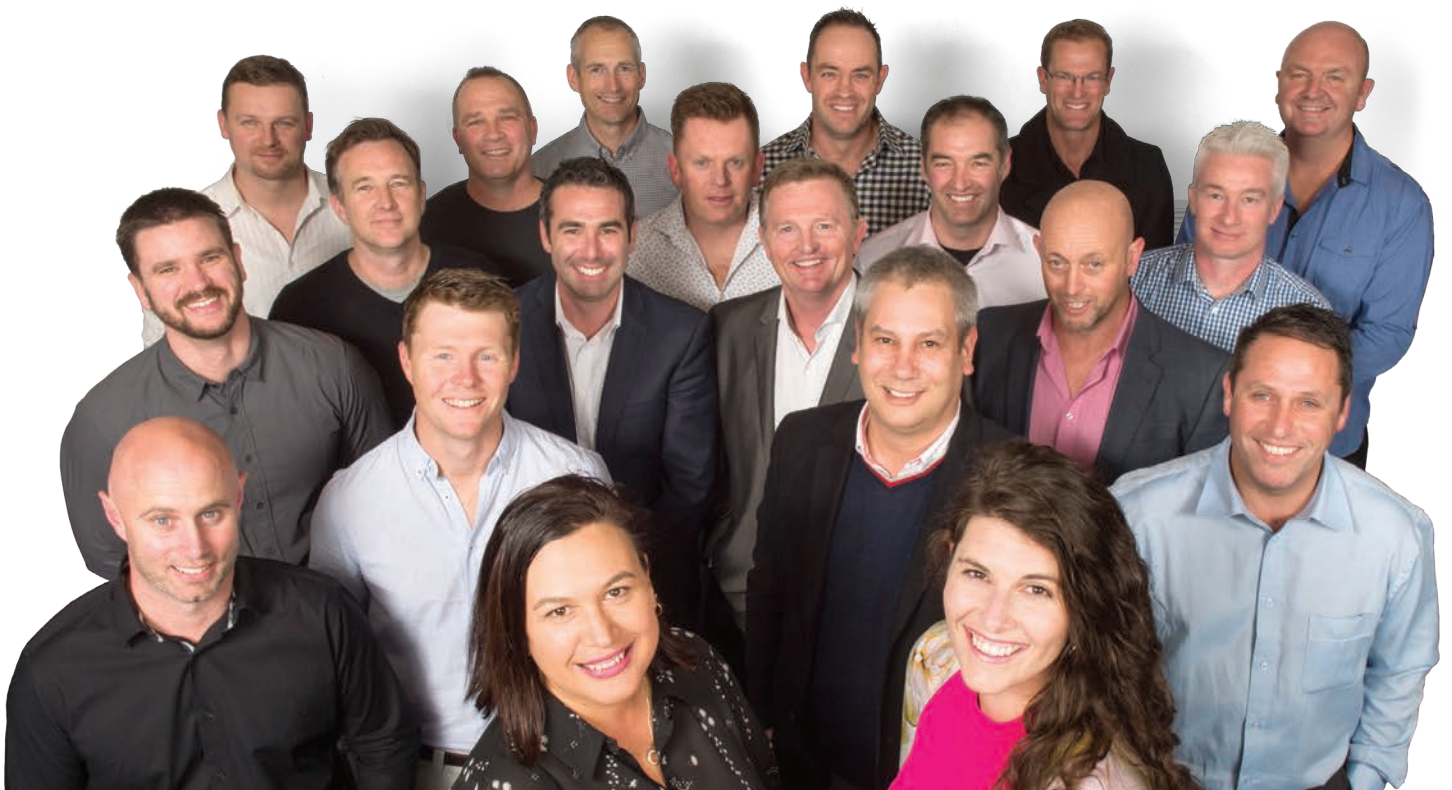
The Lead2Succeed team

"I have taken on a newly created national position within our business and I firmly believe my inclusion in Lead2Succeed played a part in this. I am really grateful for these opportunities, enjoying being challenged and the learning that comes from this, and looking forward to the rest of the journey."