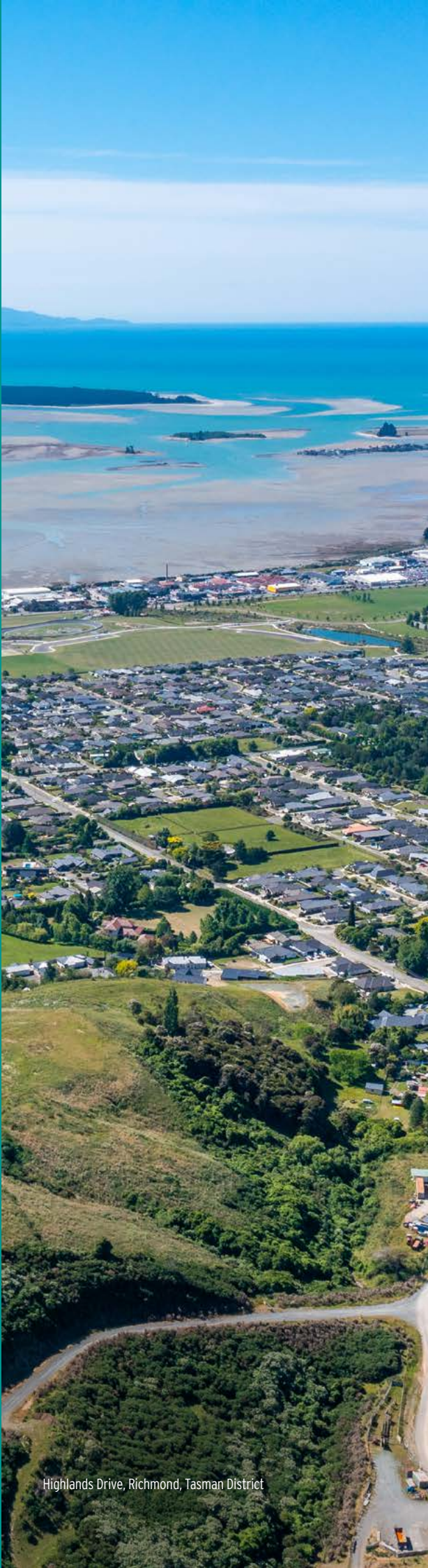
Highlands Drive, Richmond, Tasman District