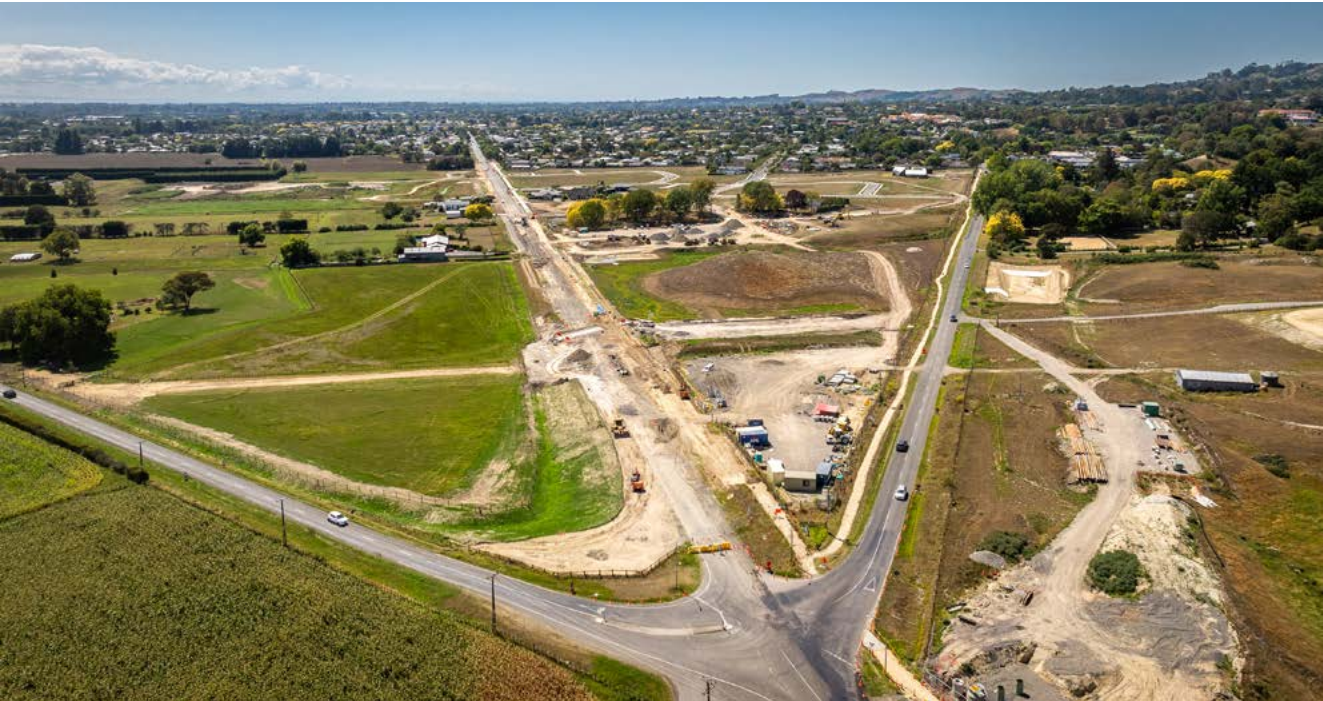
Iona Block, Havelock North, Hawke's Bay