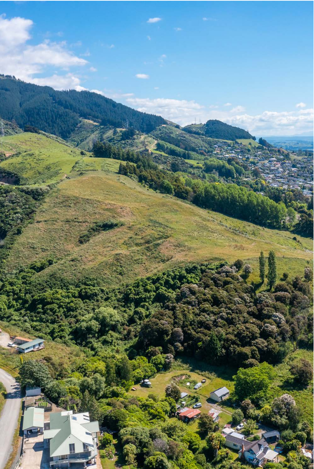
Highlands Drive, Richmond, Tasman District