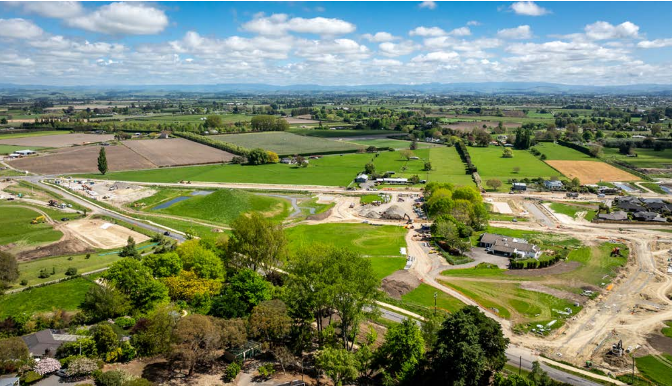
Iona Terraces, Havelock North, Hawke's Bay