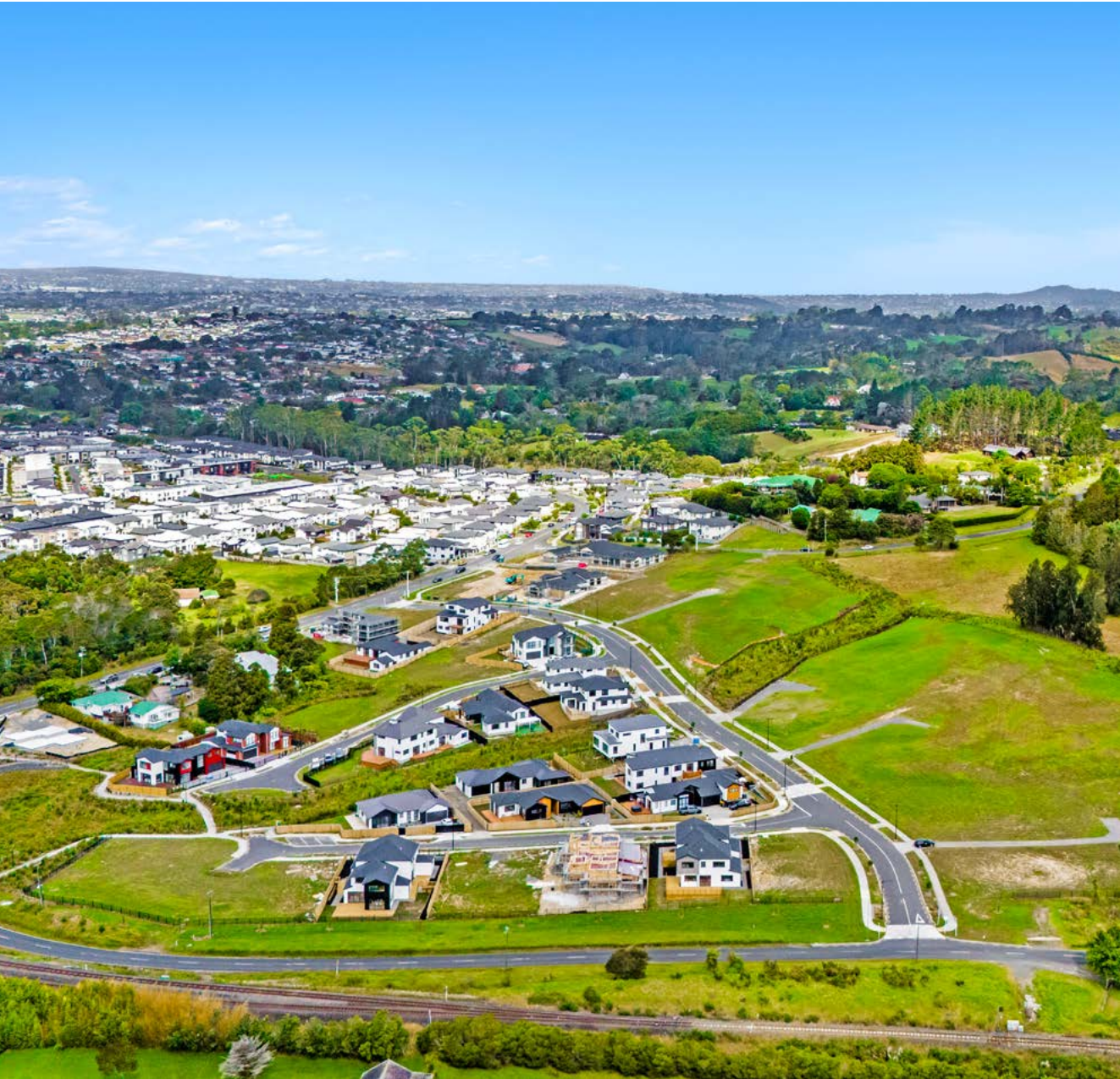
Tram Valley Road, Swanson, Auckland