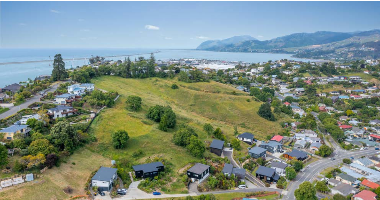
Lucas Terrace, Nelson

As this is CDI’s first year disclosing climate-related financial impacts, internal emissions price and associated business sustainability strategy (including incentives, KPIs and other targets) have not yet been fully developed. With further engagement with the CDI board, external consultants, and suppliers, CDI will be able to set up KPI’s and both external/internal targets and incentives to help us to progress with our sustainability journey.