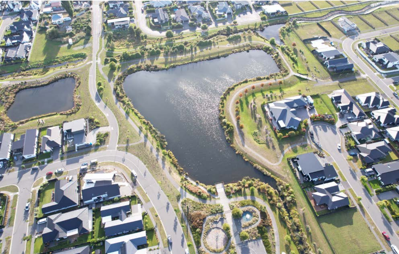
Prestons Park, Marshlands, Christchurch

To translate exposure into risk, vulnerability thresholds were developed based on CDI's operational context, considering factors such as land damage, project delays, and economic impacts. These thresholds were then applied to a standardised risk matrix to determine qualitative risk ratings for each site. Through this modelling, each property is assigned a qualitative physical risk rating across these variables, helping to prioritise which of CDI's sites require the most assessment or action.