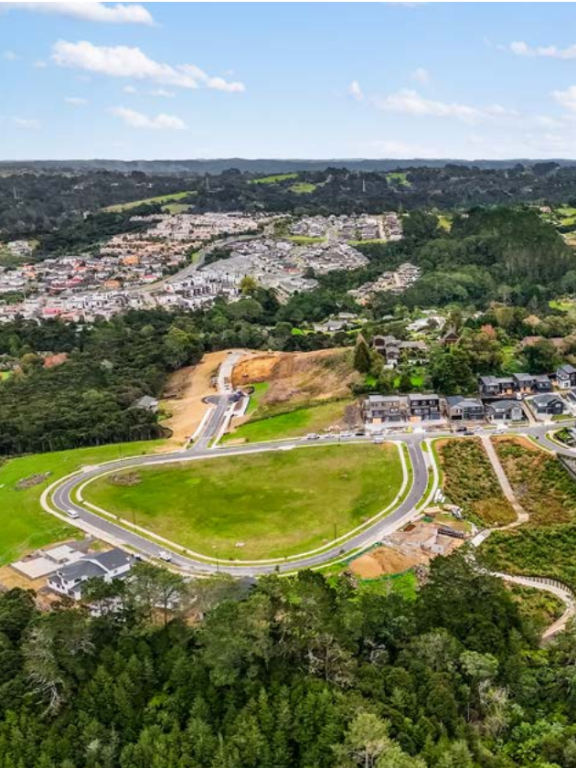
Kewa Road, Albany, Auckland

Reasonable effort has been made to source GHG emissions data within the business's capacity and available resourcing (with some estimations used). CDI is in early maturity for our GHG inventory, given that FY23 was our first reporting period (and base year). Prioritisation of initiatives have meant certain scope 3 operational emission categories have been excluded from our FY24 reporting. 6 We plan to expand on our inventory in FY25.