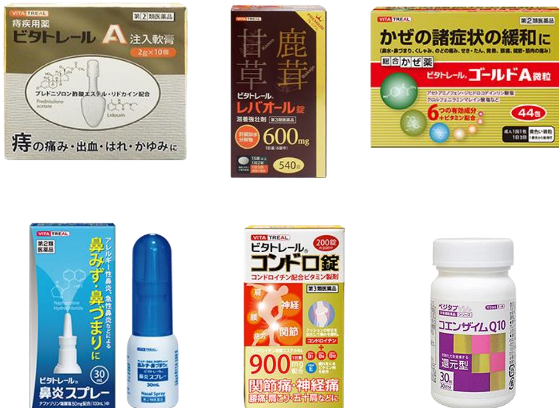
Figure 1: Examples of Medicine Plus's own Branded Products

For its financial year ended 31 August 2017, MP achieved sales of JPY4.42 billion (A$54 million 1 ) and net profit of JPY47.07 million (~A$574,000 1 ). Its net assets value as of 31 August 2017 was JPY281 million (A$3.42 million 1 ).