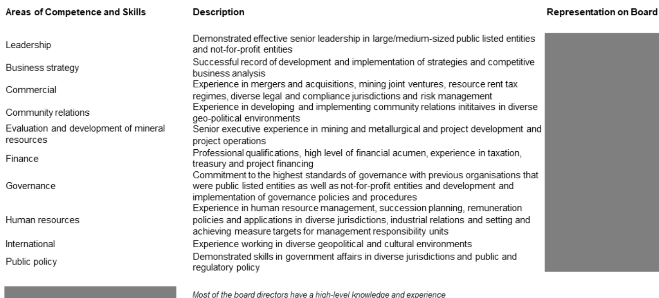
Table 2 Areas of Competence and Skills of the Board of Directors

The directors on the Board represent a diverse range of backgrounds as outlined in Table 2.