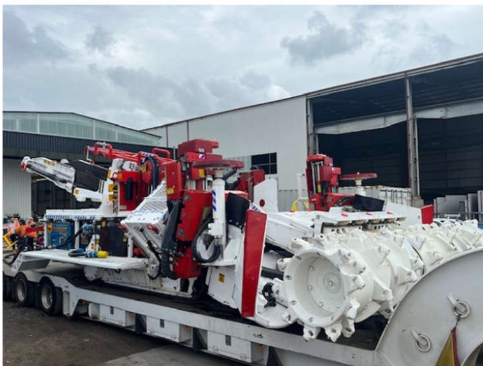
Continuous Miner post overhaul and ready for delivery to Malabar, Kurri Kurri (NSW) facility.