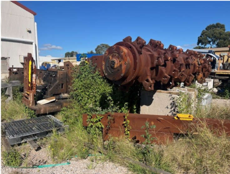
Continuous Miner pre overhaul, Kurri Kurri (NSW) facility.