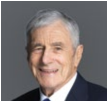
Kerry Stokes AC Chairman – Non-Executive Director

Mr Stokes was Executive Chairman of Seven Group Holdings Limited, a company with a market-leading presence in the resources services sector in Australia and formerly in north east China and a significant investment in energy and also in media in Australia through Seven West Media. Mr Stokes held this position from April 2010 until November 2021. He is also Chairman of Australian Capital Equity Pty Limited, which has substantial interests in media and entertainment, resources, energy, property, pastoral and industrial activities.