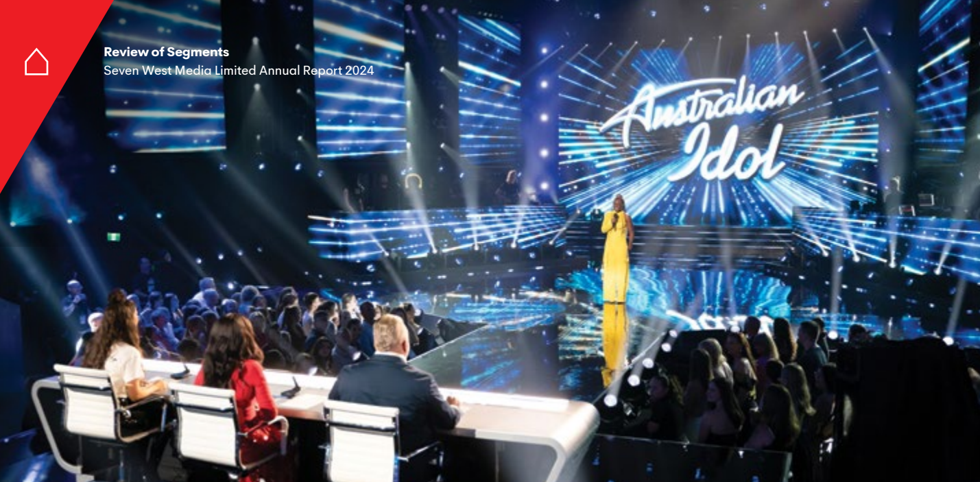
Australian Idol – Channel 7 and 7plus

As announced at the Group's FY22 year end results announcement, the Group commenced a 12 month on-market share buy-back for up to 10% of shares on issues. As part of the Group's FY23 year end results announcement, it was announced that this program was being continued for a further 12-month period. As at 30 June 2024, 50,977,737 shares ($18,864,000) have been bought back at an average price of $0.37 under this program, of which, 14,430,739 shares ($3,866,000) were purchased in the period to 30 June 2024. This program will not continue in FY25.