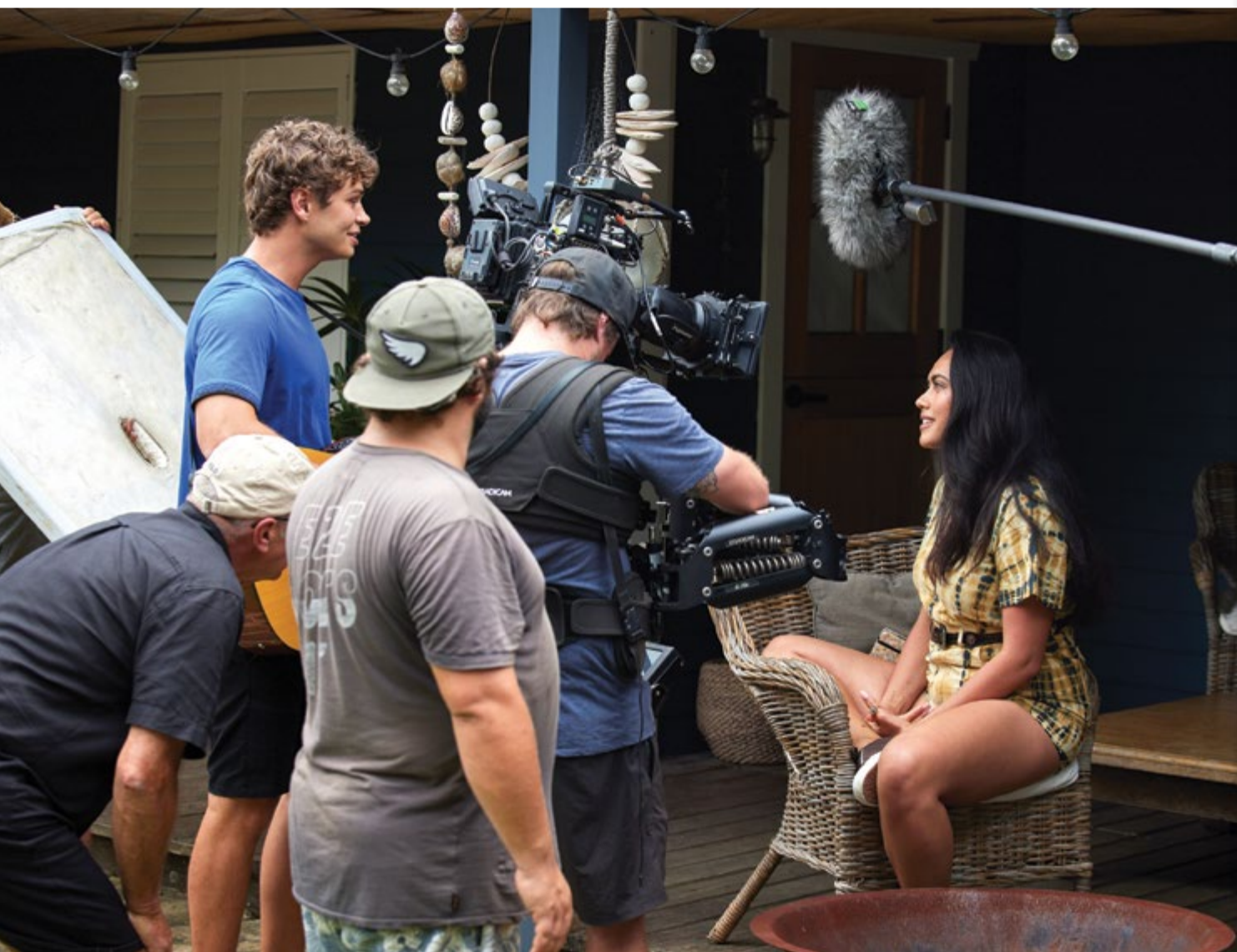
Home and Away

Every month, Seven reaches more than 17 million people nationally across broadcast and digital.