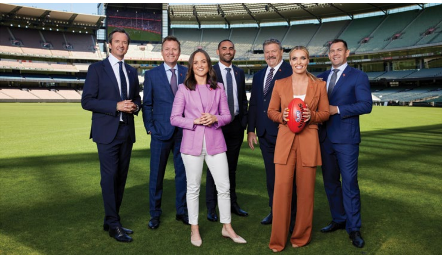
2023 AFL Finals Series

Significant items in the prior period also related to implementation costs in relation to Project Phoenix being partially offset by fair value gains recognised on the Group's ventures portfolio and gain on the sale of Pymont and Mackay property sales.