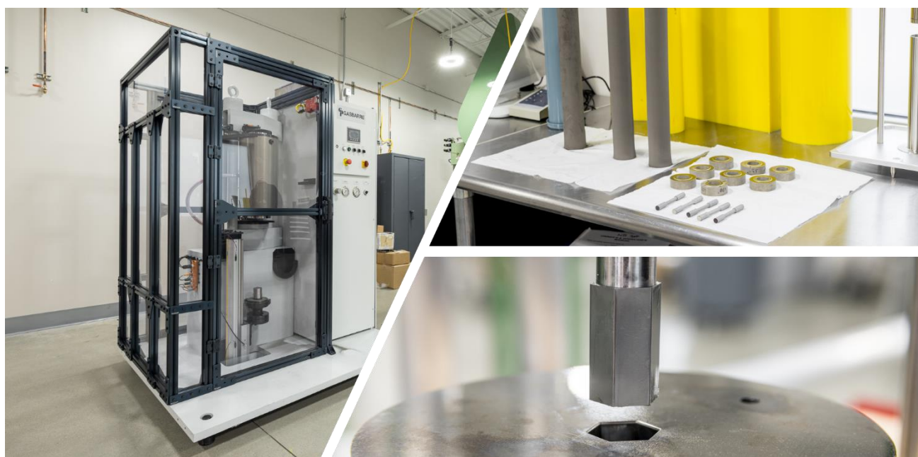
Figure 3: Powder to Parts Manufacturing Equipment