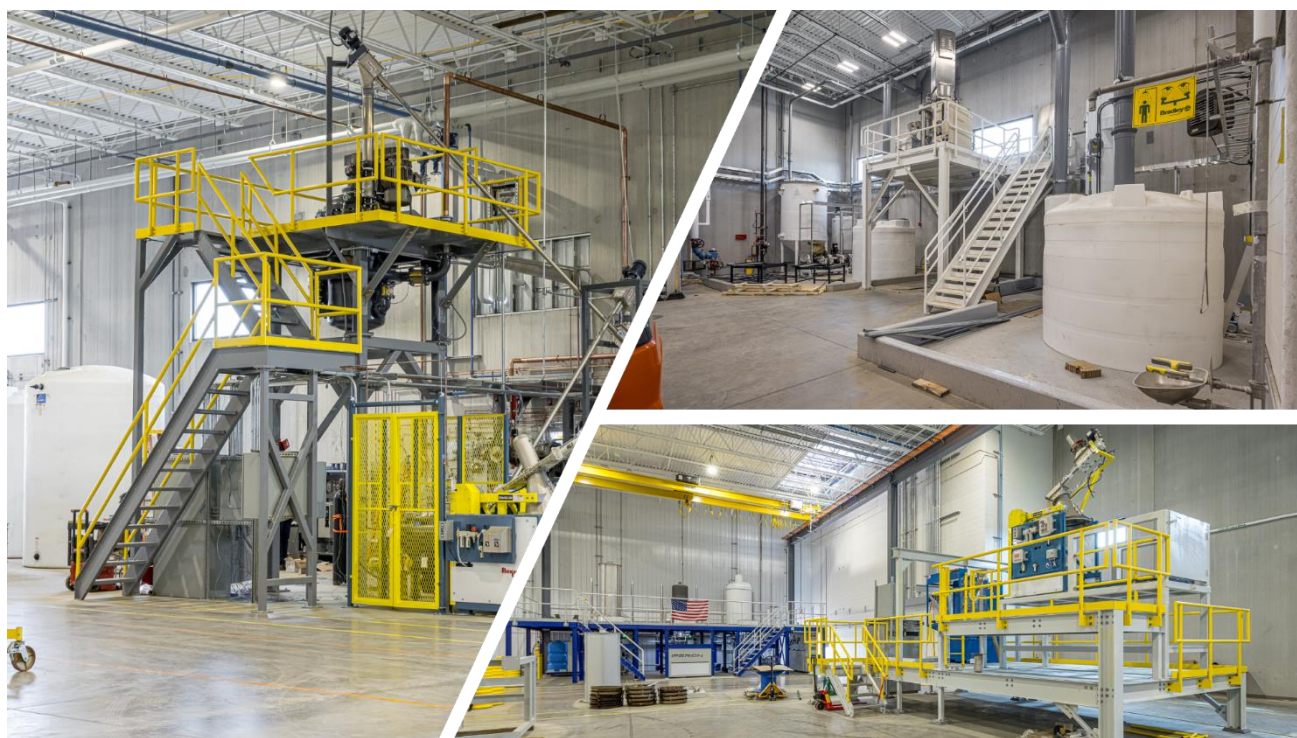
Figure 2: Ancillary Equipment and Utilities Installation

As operations scale, IperionX expects to expand product development activities to support a growing customer pipeline across a wide range of industries, including those targeting advanced robotics, mobility, and precision engineering.