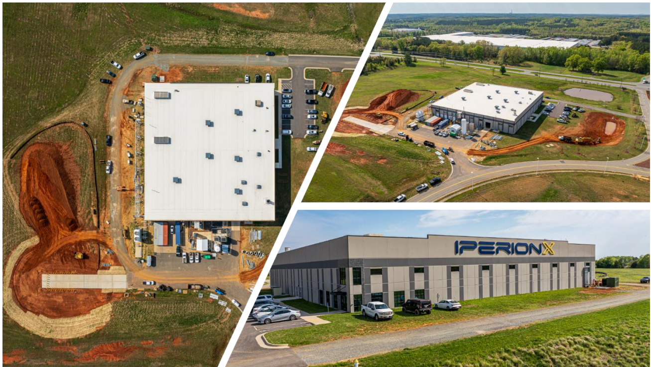
Figure 1: Titanium Production Facility, location of the HAMR furnace operations

Commissioning of IperionX's Titanium Manufacturing Campus in Virginia continued at pace during the quarter, with steady-state full-system titanium production targeted to commence by mid-2025.