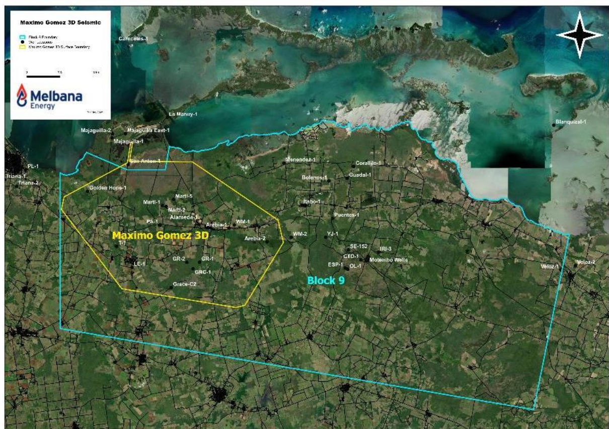
Figure 6 - Location of the proposed Maximo Gomez 3D seismic survey

Proposals for the proposed 3D seismic survey have recently been received from four international companies. Following a period of evaluation, a preferred tenderer is expected to be nominated based on a combination of qualification factors including cost, technical and operational capabilities. The proposal included four potential survey designs to address the challenge to image subsurface targets ranging from 200 metres below surface to greater than 4000 metres. The survey would require the seismic waves to be generated using vibrators as well as dynamite. In addition to providing vital information required for the efficient development of the Alameda and Amistad Fields, the survey area also include the highly prospective