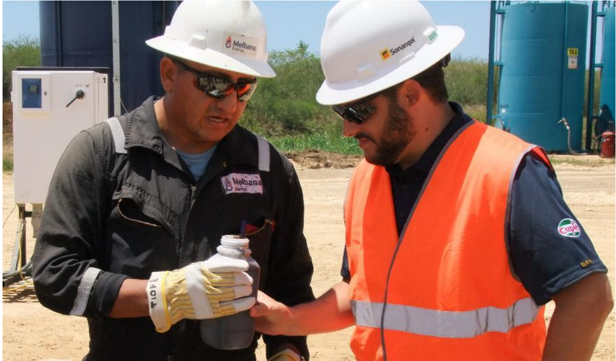
Figure 1 - Inspecting a sample of crude oil production from Alameda-2

With more than 15,000 barrels of oil now in storage, the first shipment could take place towards the end of next month. The intended buyer of the oil is currently conducting investigations into the timing and availability of either a suitable coastal tanker or pooling the cargo with scheduled upcoming exports of larger volumes of crude oil.