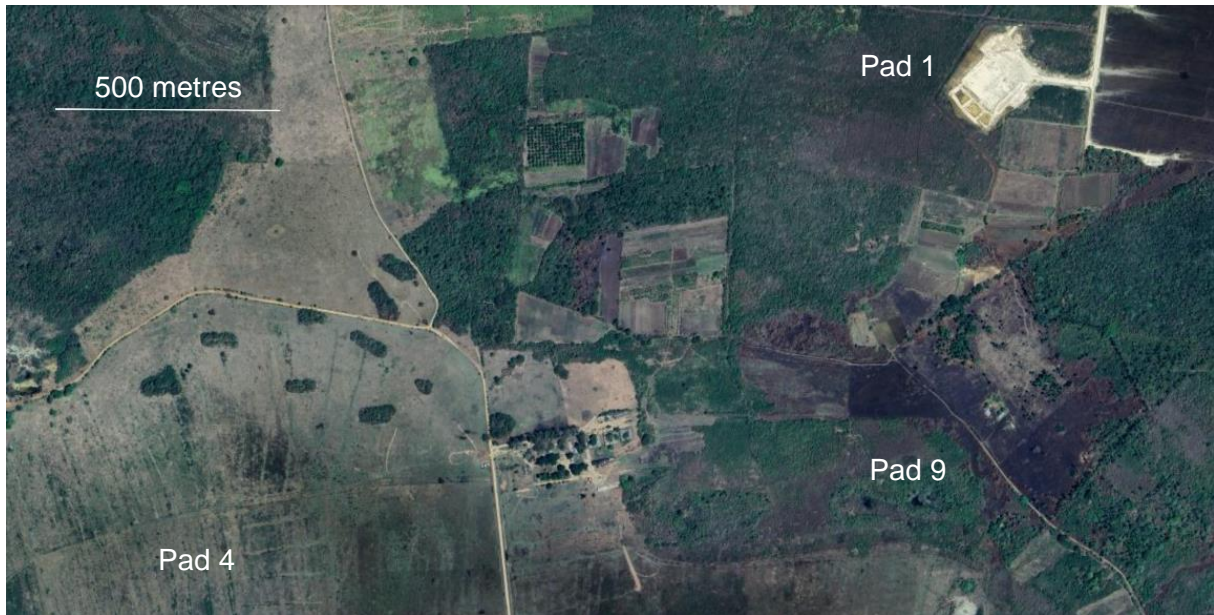
Figure 3 – Location of new pads for upcoming production wells