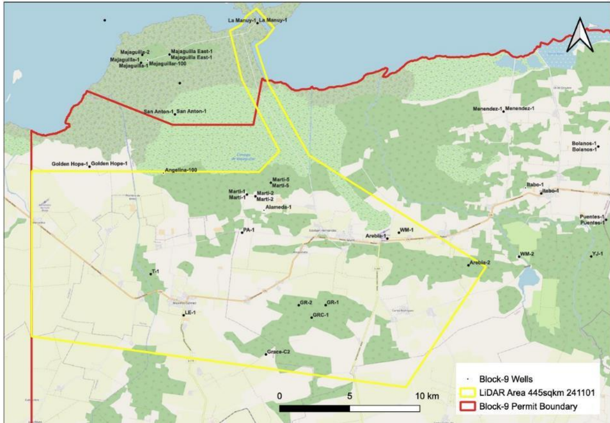
Figure 7 - Location of the LiDAR survey conducted in 1Q 2025

Máximo Gómez and Grace leads which are presently poorly defined by existing 2D seismic data. The objective is to commence permitting for the survey as soon as the preferred tenderer is chosen, with acquisition anticipated to commence in Cuba's next dry season (November 2025 to April 2026).