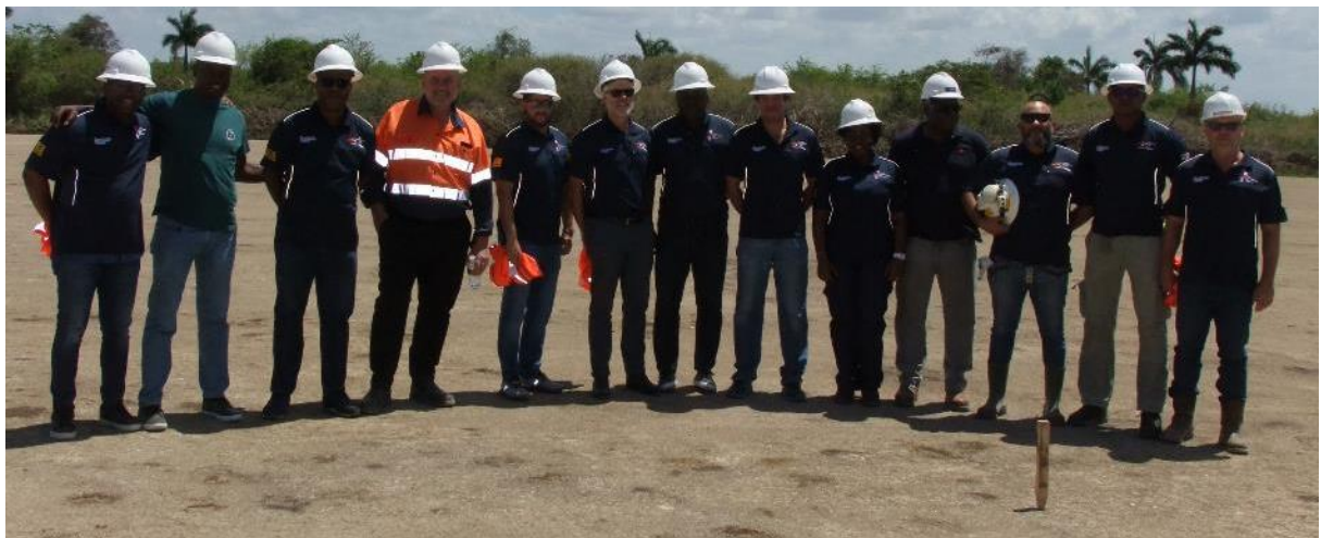
Figure 2 - Inspection of pad and position of upcoming Amistad-2 production well - April 2025

Construction of Pad 9 and access roads for the drilling of Amistad-2, located approximately 850 metres to the southwest of Alameda-2 on Pad 1 (see Figure 3), are complete and all material permits required to commence drilling have been received. The well is to be a dedicated Unit 1B oil producer and its design has been significantly simplified by incorporating lessons learned from previous wells. Drilling to total depth is expected to take less than three weeks, with completion and testing to follow.