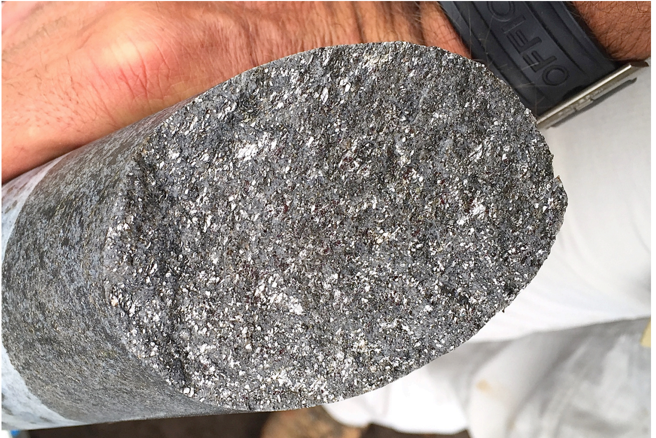
Photo 2: RC diamond Core showing coarse graphite flakes at Epanko North, Hole DD01. Core is 64mm diameter.