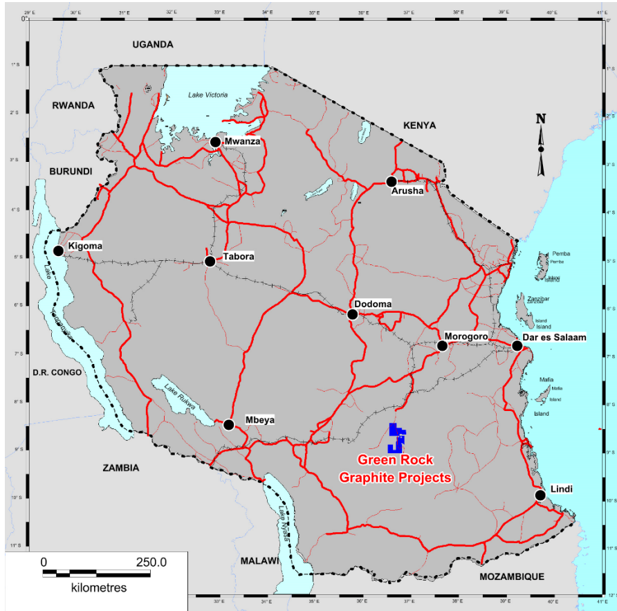
Map 1: Project Location