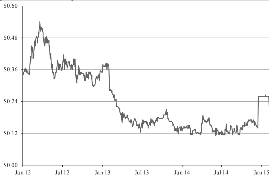
Resource Equipment – share price history 1 January 2012 to 19 February 2015