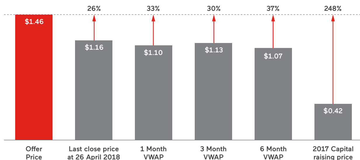
FIGURE 1: OFFER PREMIUM RELATIVE TO RECENT TRADING PRICES PRIOR TO THE ANNOUNCEMENT DATE

In addition, the Offer Price represents a premium of 248% to the issue price of $0.42 per share under MDL's capital raising in March 2017.