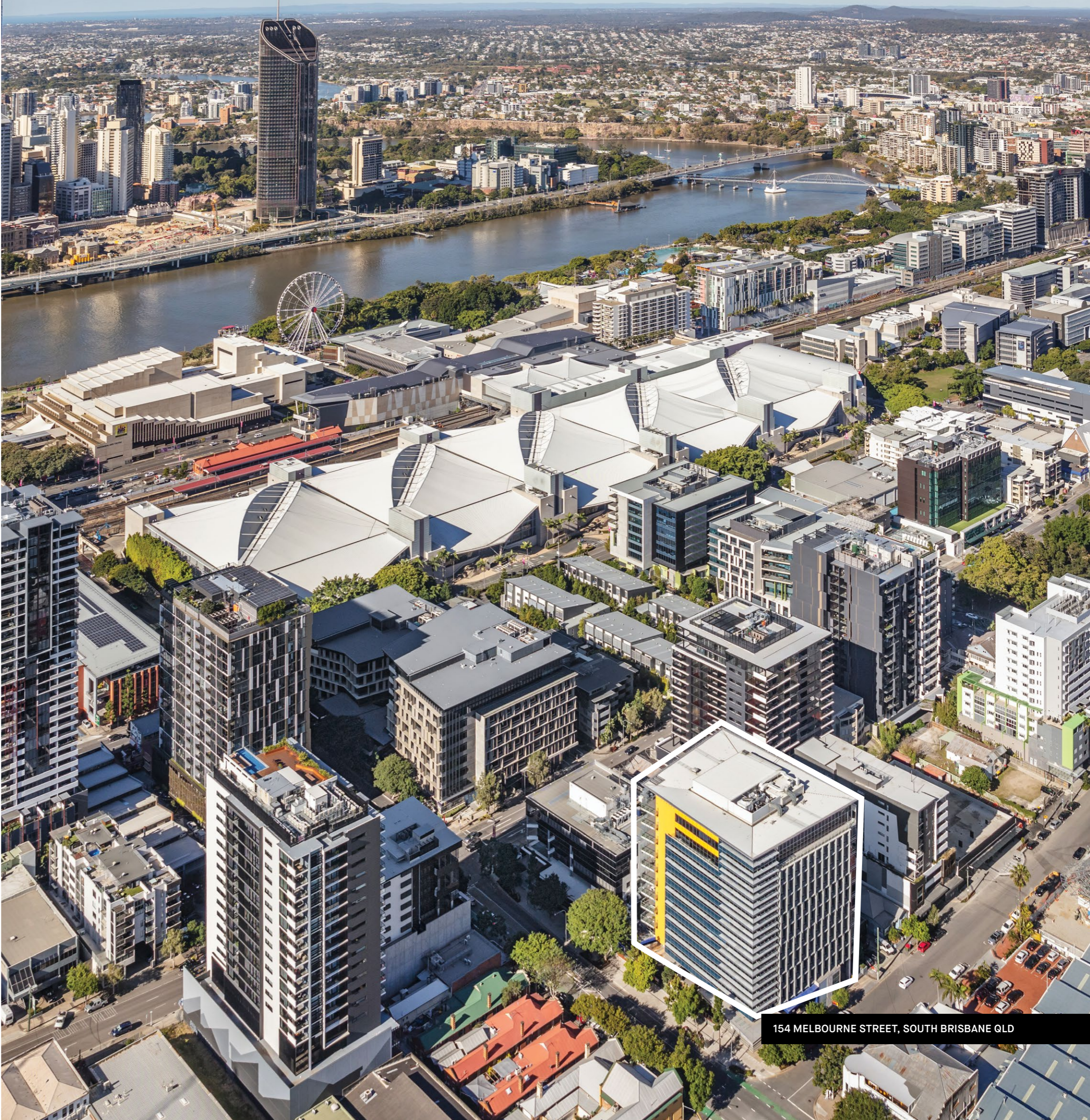
154 MELBOURNE STREET, SOUTH BRISBANE QLD