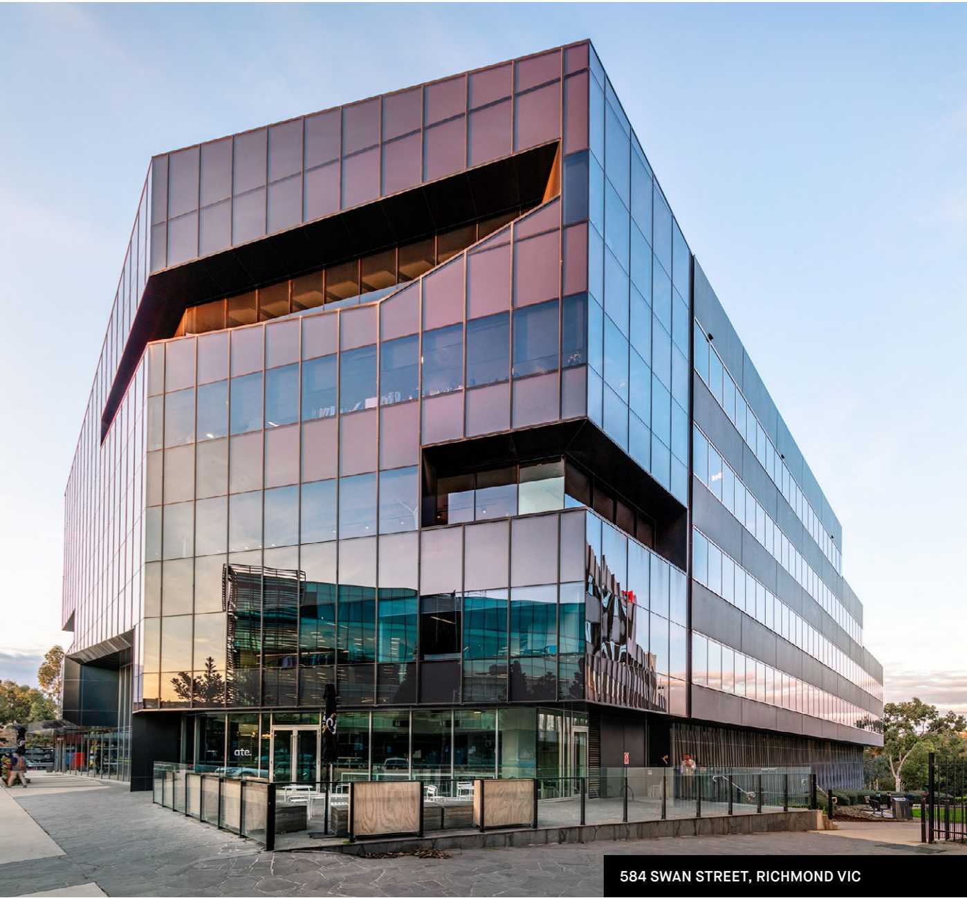
584 SWAN STREET, RICHMOND VIC

Securityholders may also communicate with the Group through the contact details provided on the Group's website.