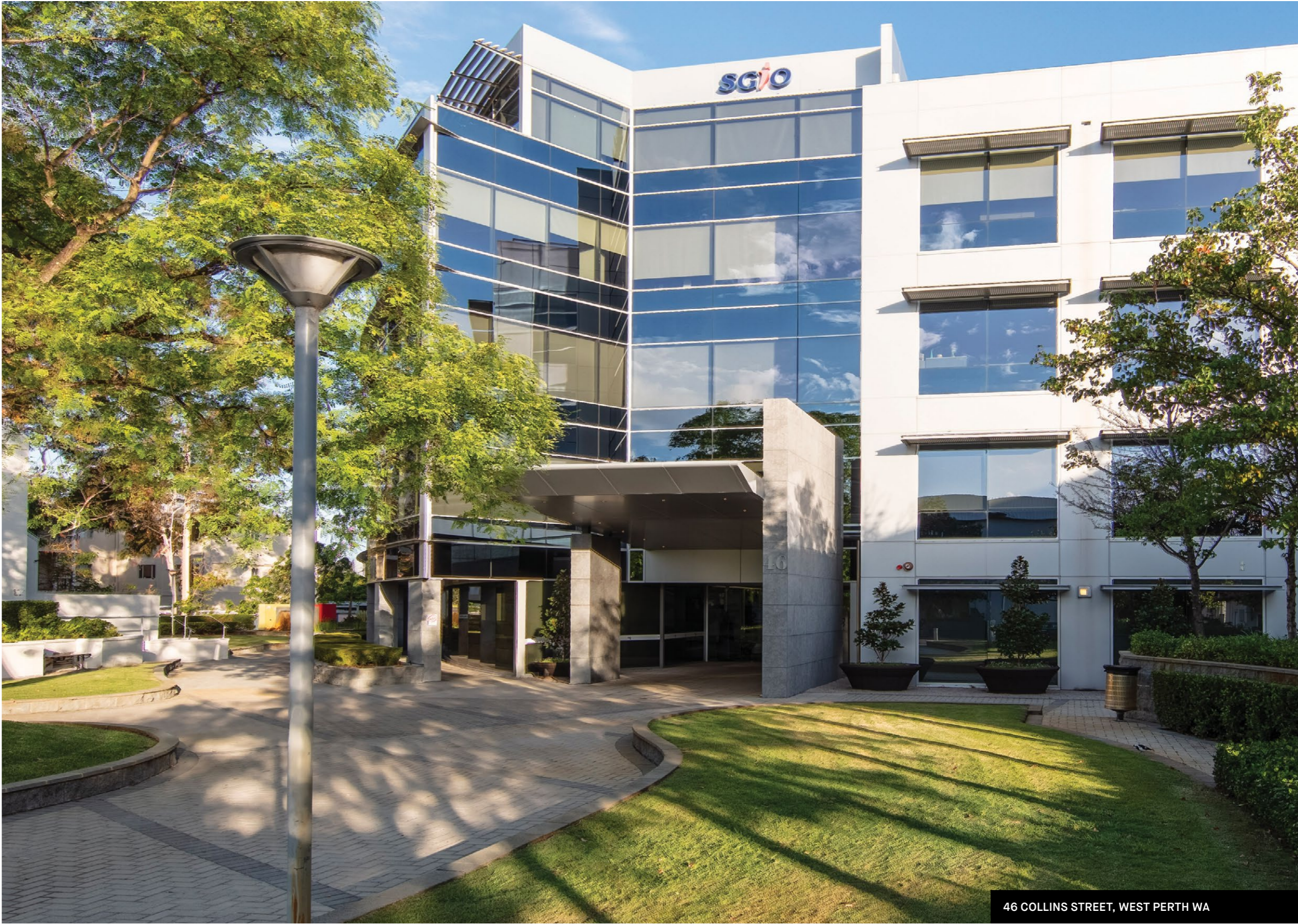
46 COLLINS STREET, WEST PERTH WA

Subsidiary companies within the Group, such as CPFL, act as manager of commercial, industrial and development properties that can have exposure to environmental sustainability risks, including climate-related risks, for example, meeting environmental rating standards, remediating sites affected by potential environmental liabilities, or managing risks related to the future potential impacts of climate change. These risks are managed in accordance with the Group’s Risk Management Framework and with the assistance of specialist professionals where required. Further details of the Group’s sustainability risk management approach and initiatives are outlined in the Centuria Environmental, Social and Governance (ESG) Policy and Sustainability Report, which is updated annually and published. The Centuria ESG Policy is available at centuria.com.au/centuria-capital/corporate/governance and the Sustainability Report is available at centuria.com.au/centuria-capital/corporate/sustainability .