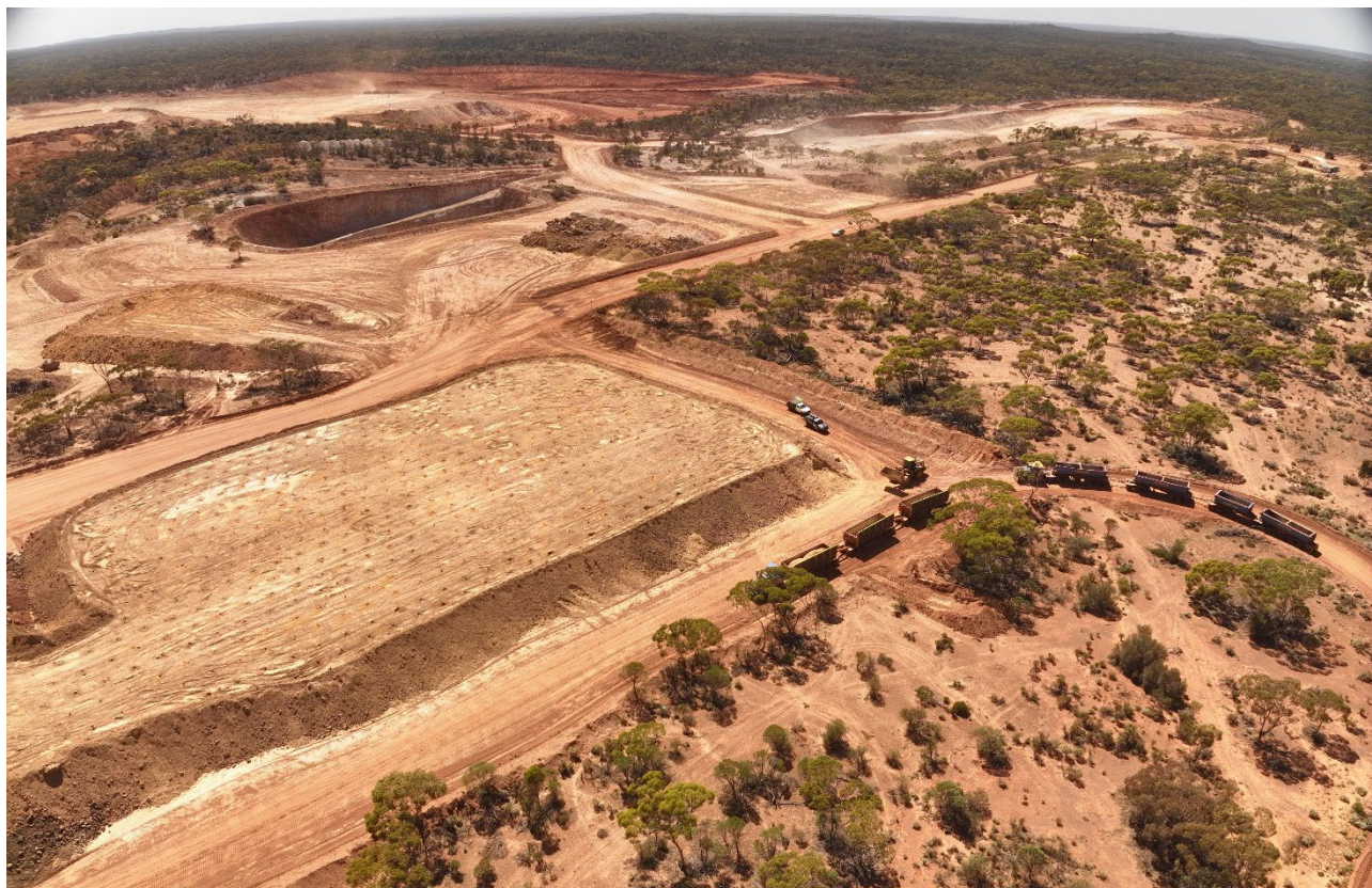
Figure 2: First road trains loading ore with open pit operations in the background