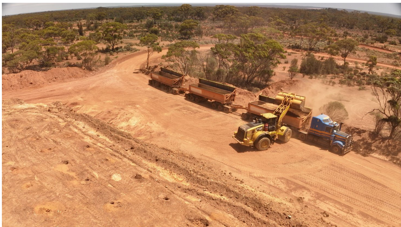
Figure 3: First Boorara ore being loaded on route to Paddington Mill