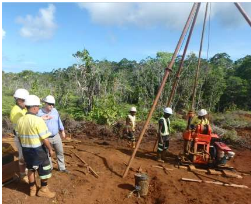
Figure 2 San Jorge drilling operations