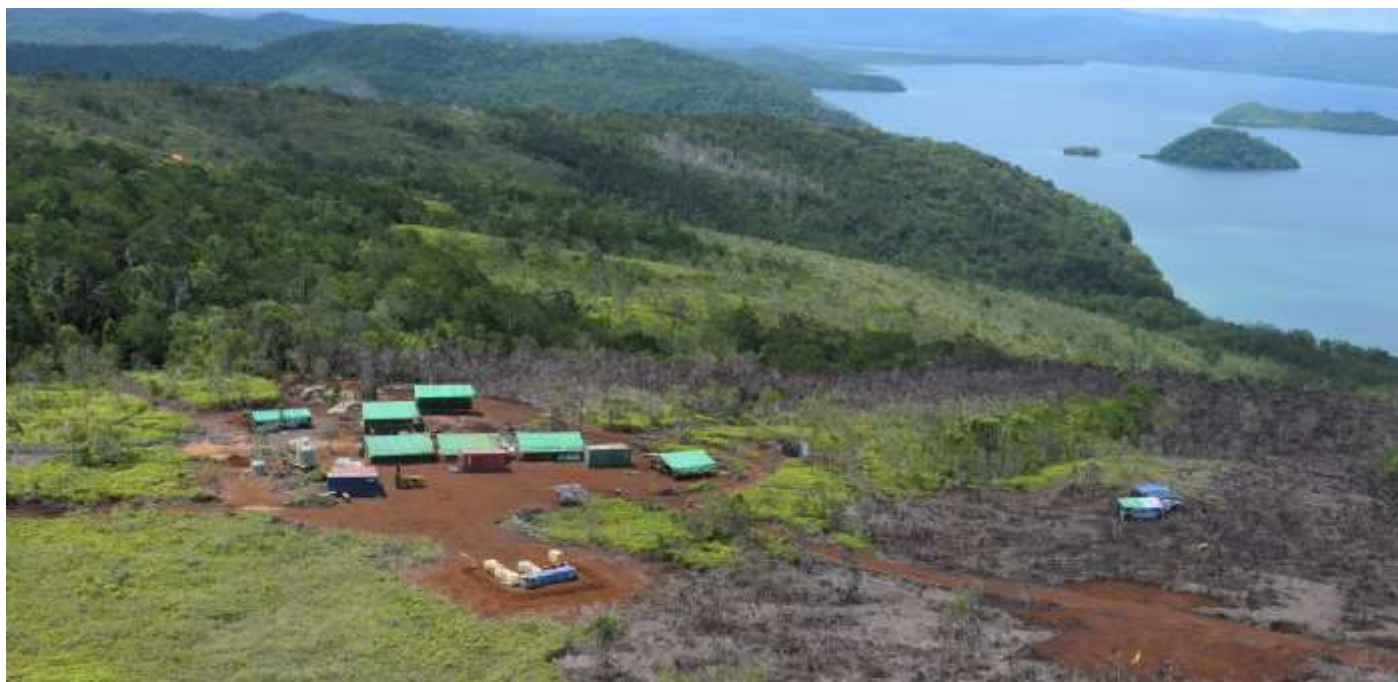
Figure 1 San Jorge exploration camp