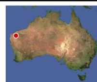
Figure 1: Paulsens East Iron Ore Mine Location – Haulage Routes to Port Hedland and Port of Ashburton