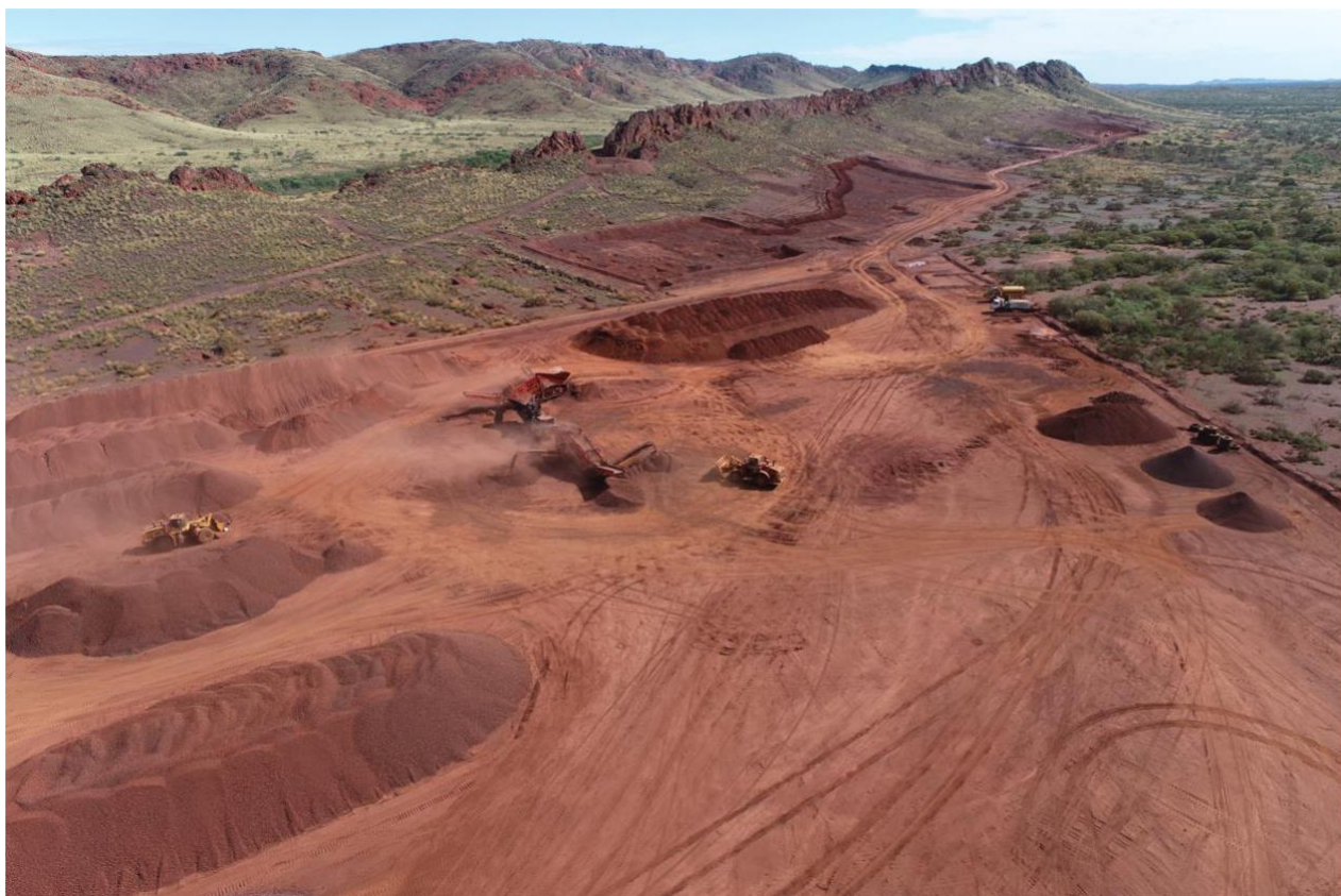
Figure 7: Stockpile area located north of Paulsens East hematite ridge with detritals mining areas in the distance