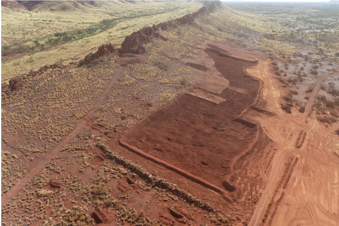
Figure 5: Excavation of Detritals Iron Ore on Northern Slope of Paulsens East Hematite Ridge

Mining operations are continuing with the excavation, screening and crushing of surface detrital iron ore on the northern slopes of the Paulsens East Hematite Ridge.