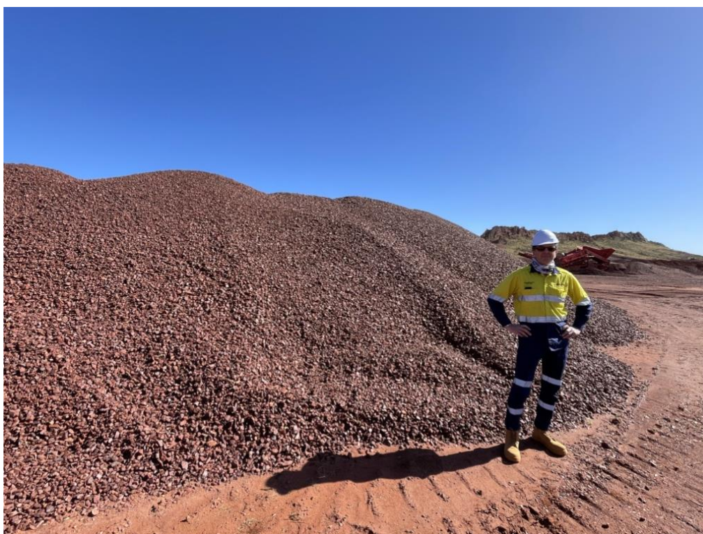
Figure 8: Stockpile of Paulsens East Lump DSO