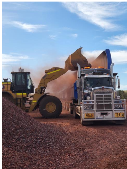
Figures 2 and 3: Loading Paulsens East Lump DSO on to Road Train