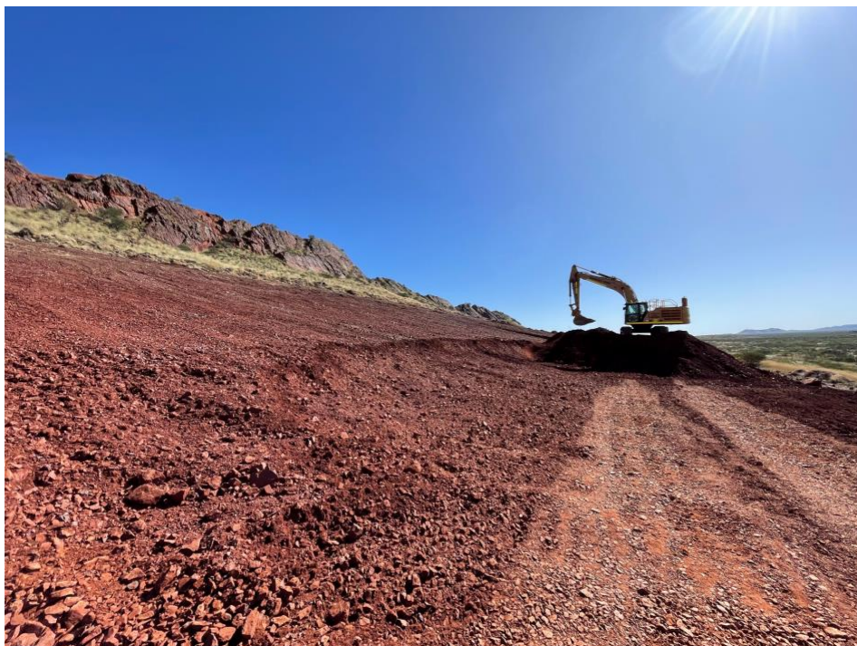
Figure 6: Mining of Detritals Iron Ore at Paulsens East