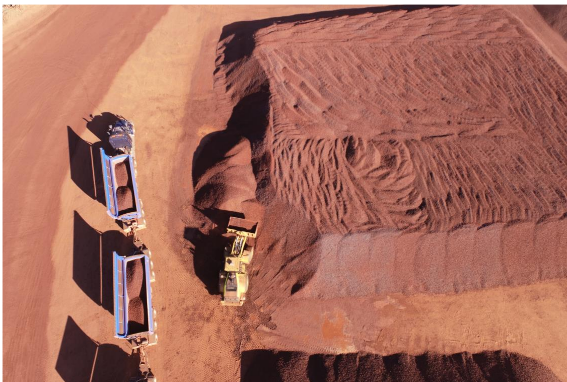
Figure 4: Loading of Road Train