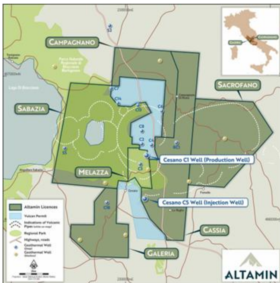
Figure 1: Lazio Project Exploration Licences

The Lazio project area consists of six Exploration Licences (ELs) illustrated in Figure 1 below, at Campagnano, Galeria, Melazza, Cassia, Sacrofano and Sabazia in the Lazio region, 30km NW of Rome. The ELs covers approximately 11,000ha in the Cesano geothermal field which was drilled and tested for geothermal energy production by the Italian state power company in the 1970s and 1980s.