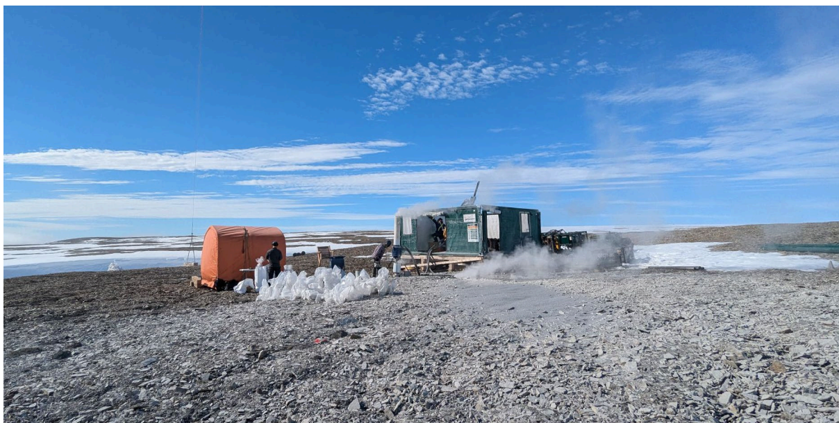
Figure 1: Reverse Circulation (RC) drilling underway in the Storm area, Nunavut, Canada.

American West Metals Limited ( American West Metals or the Company ) (ASX: AW1) is pleased to provide an update on the remaining drilling from the 2024 program at the Storm Copper Project ( Storm or the Project ) on Somerset Island, Nunavut, Canada.