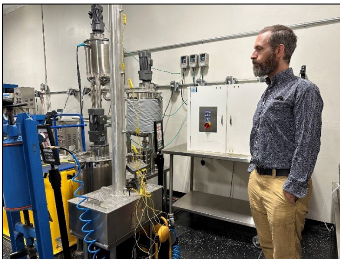
Testwork on carbon capture of existing tailings

On average, the tailings exhibited a 15% carbonation rate. This means that for every ton of tailings re-exposed to oxygen, approximately 150 kilograms of carbon dioxide was captured. This carbon sequestration potential could generate additional revenue or be offered as a value-added benefit to offset emissions for customers.