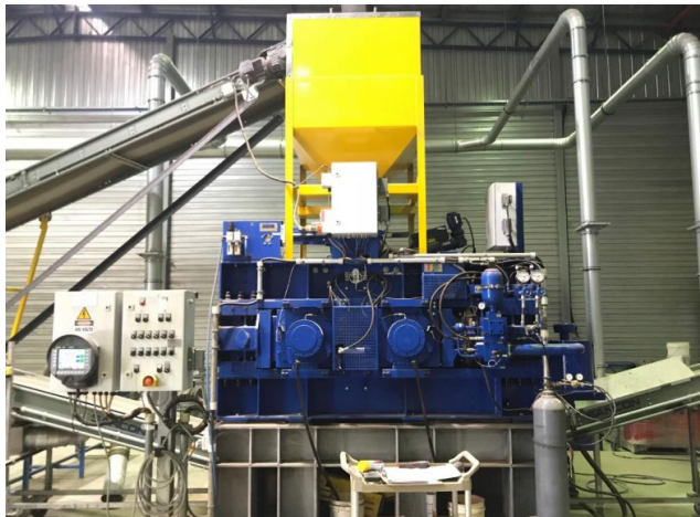
HPGR test unit at Bureau Veritas Minerals Laboratory, Perth, Australia