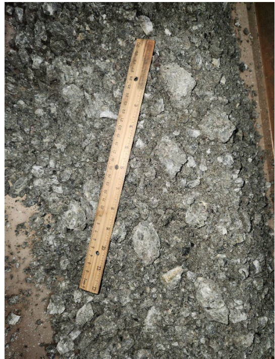
Caravel ore crushed using Enduron® test unit