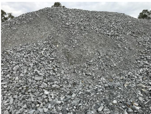
Figure 1: Magnesite stockpile (Adelaide)

As announced on 8 November 2016, Archer will be undertaking a magnesite processing bulk trial at an operating kiln. Magnesite ore has been mined and stockpiled in Adelaide in preparation for the trial. The purpose of the trial is to confirm that a commercial grade caustic calcined magnesia (CCM) and dead burned magnesia (DBM) product can be manufactured in an operating kiln. The resulting magnesia products will then be distributed to potential customers for analysis and testing.