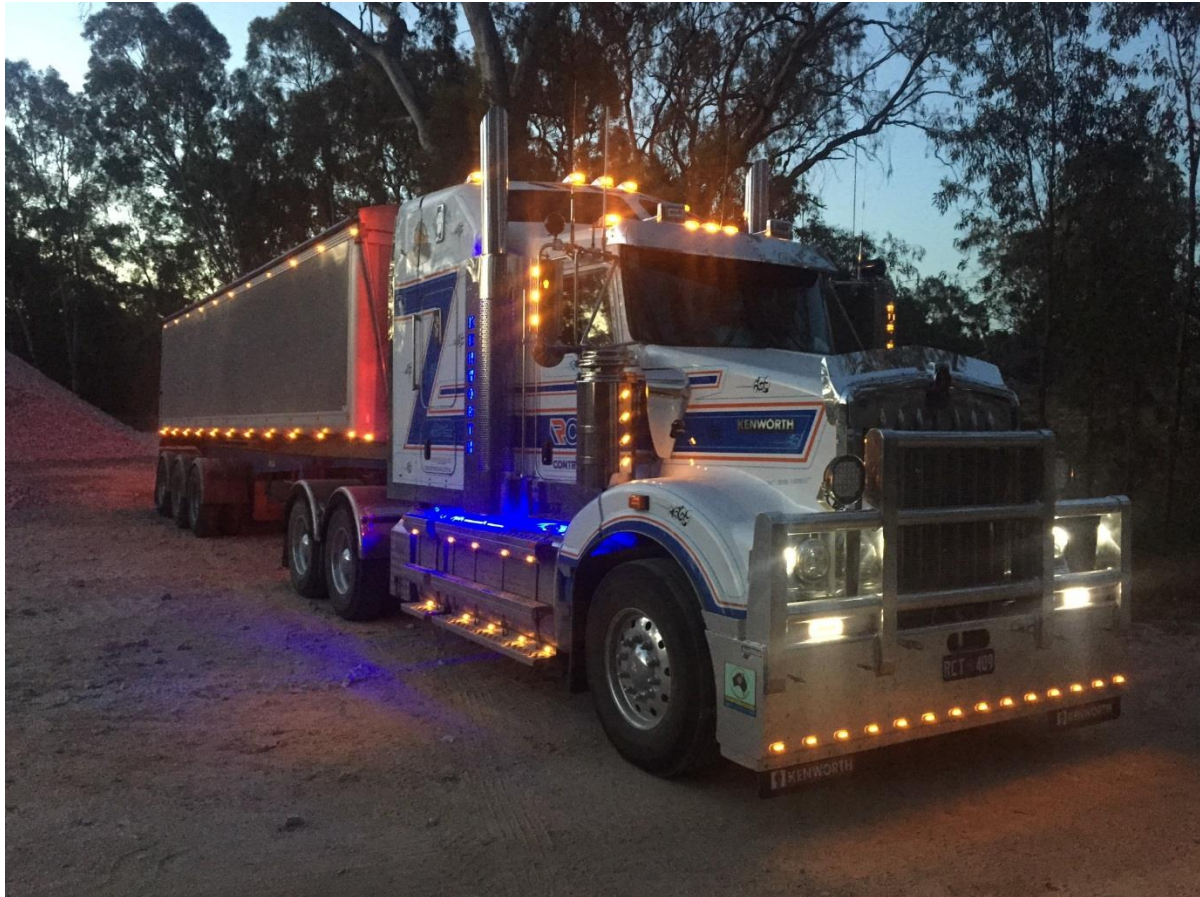
Figure 4: Ross Contractors truck used for magnesite transport

The long life and superior physical and chemical properties of the LCM cryptocrystalline magnesite deposits provide a unique opportunity to develop and grow a large scale, low cost, high value magnesia business