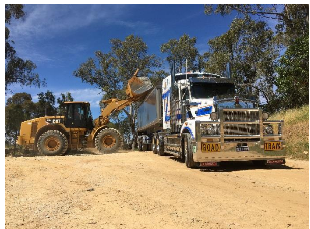
Figure 2: Loading of magnesite for transport to Whyalla