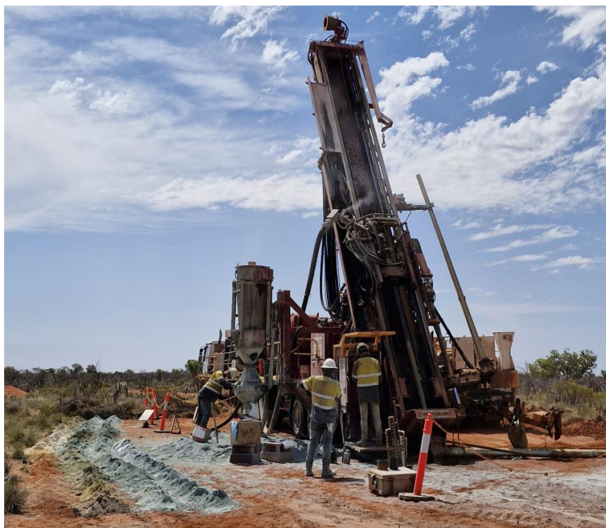
Figure 1: RC Drill Rig at Mount Berghaus

Mantle Minerals Limited ( ASX:MTL ) ("Mantle") ("the Company") is pleased to advise that deep reverse circulation drilling at Roberts Hill (E47/3846) and Mount Berghaus (E45/5899) has commenced.