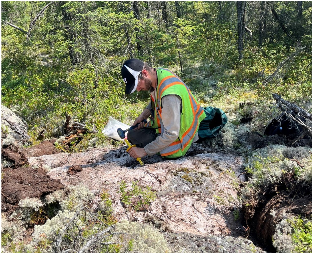
Figure 2: Initial Sampling of identified Pegmatites