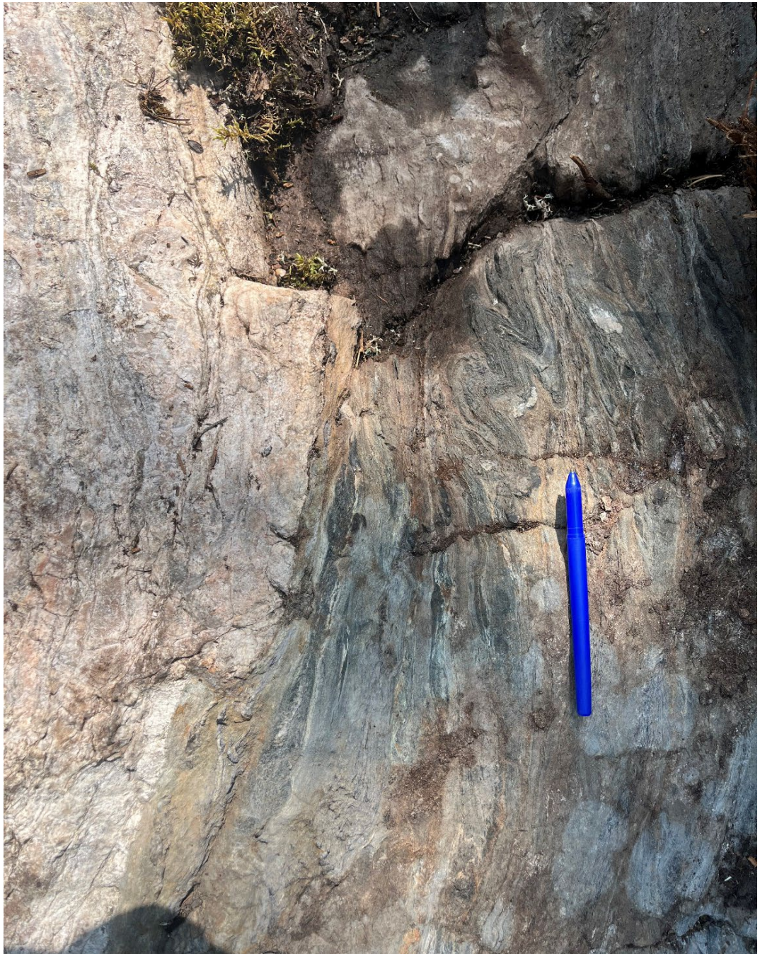
Figure 3: Pegmatite emplaced along a metasedimentary contact zone.