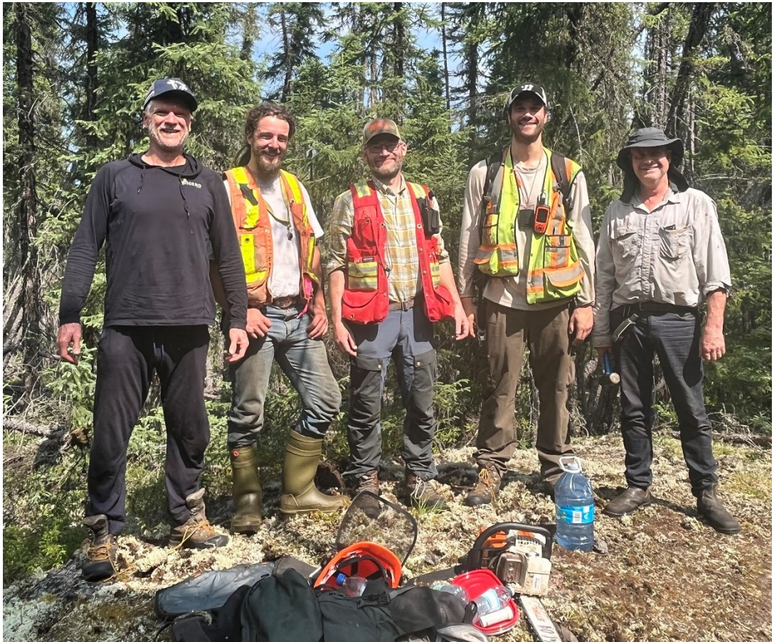
Figure 1: Field Personal on site at North Spirit Lithium Project