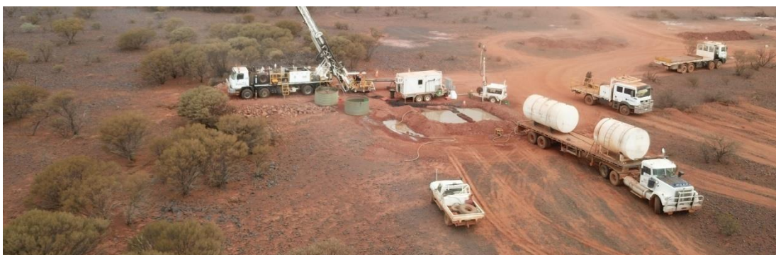
Figure 1 Diamond drill rig on site at The Australian Vanadium Project