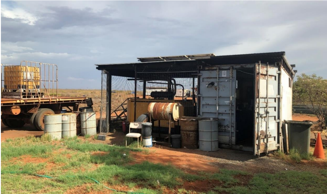
Figure 7 Existing diesel generator location at Strelley Community School