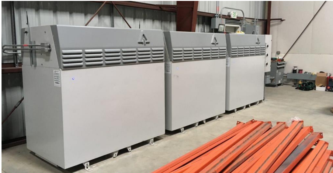
Figure 6 Avalon Battery VRFBs

Final configuration is dependent on results of grant application. The VRFB solution for this project is being supplied by battery manufacturer Avalon Battery. The VRFB's strengths are its longevity; lack of performance degradation over time; thousands of cycles; 100% depth of discharge and the ability to re-use the non-flammable vanadium electrolyte at the end of the battery's life. Avalon Battery has recently entered into an agreement with South African vanadium producer, Bushveld Minerals, to provide a leasing option for vanadium electrolyte. This reduces the capex of the VRFB and provides security of electrolyte disposal in the future.