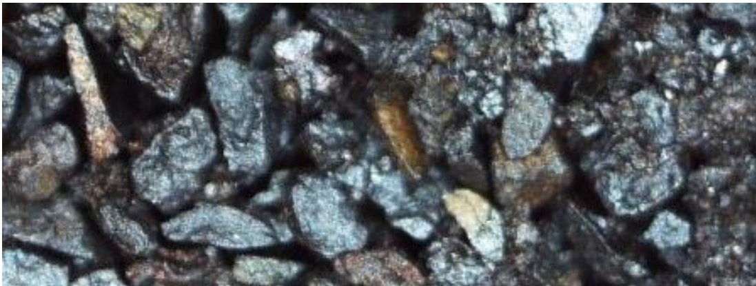
Figure 2 Magnetic concentrate sample from the initial 6 tonne pilot test

The low silica content of the concentrate, at 1.37%, combined with an improved V_2O_5 grade of 1.44% is likely to reduce reagent usage and improve overall throughput in the refinery. Silica consumes soda ash in the roasting process, which also decreases vanadium recovery, meaning that lower silica is a benefit.