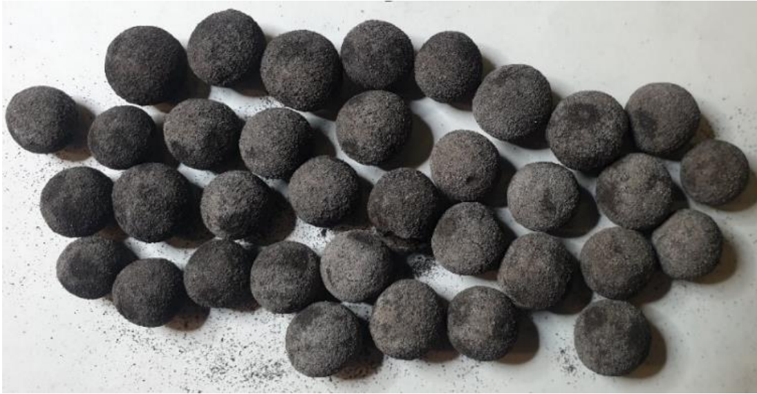
Figure 3 Vanadium rich iron concentrate pellets produced during bench-scale roast testing