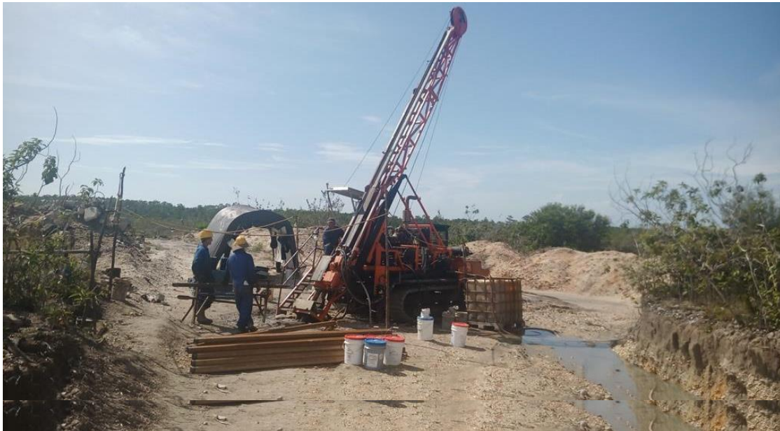
Drilling - El Pilar