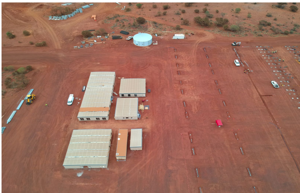
Installation of accommodation village

Mintrex and ECG Engineering have been appointed to undertake engineering, plant design and electrical works for the KGP. The major change to the plant design from the 2018 study has been a move to a three stage crushing circuit and single ball mill, which is designed to achieve a throughput in the order of 3.5-4.0 mtpa in fresh ore. The expected average gold production range is between 105,000 to 120,000 ounces per annum, representing significant upside to the average life of mine production estimate of 100,000 ounces per annum reported in the 2018 study.