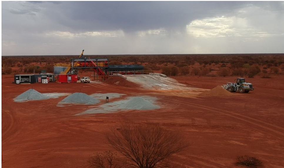
Concrete Batching Plant

During the six months to 31 December 2019, Capricorn progressed the development and operating parameters for the KGP. Work continued on the installation of the 306-room accommodation village with the establishment of a batching plant and pouring of concrete footings. It is expected that the village will be ready for occupation by the end of the March 2020 quarter.