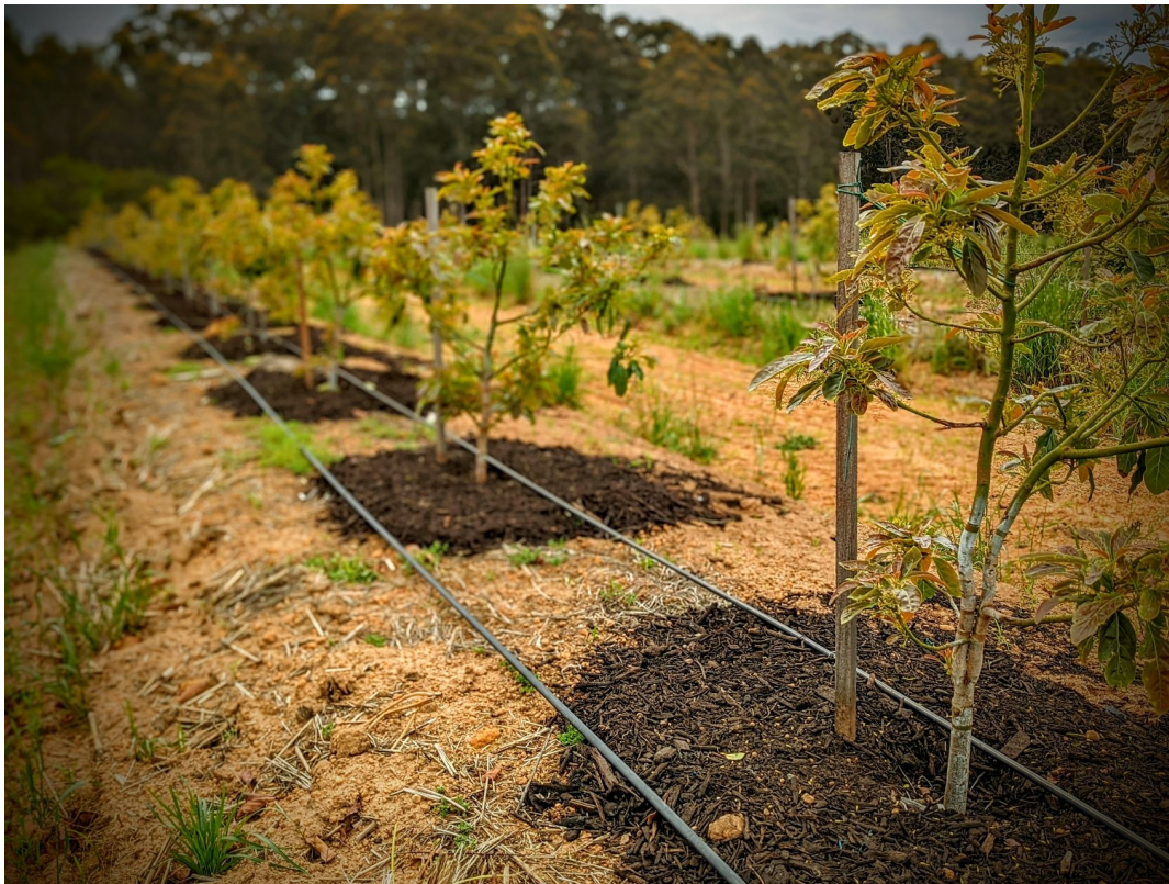
Stage 1 trees one year on