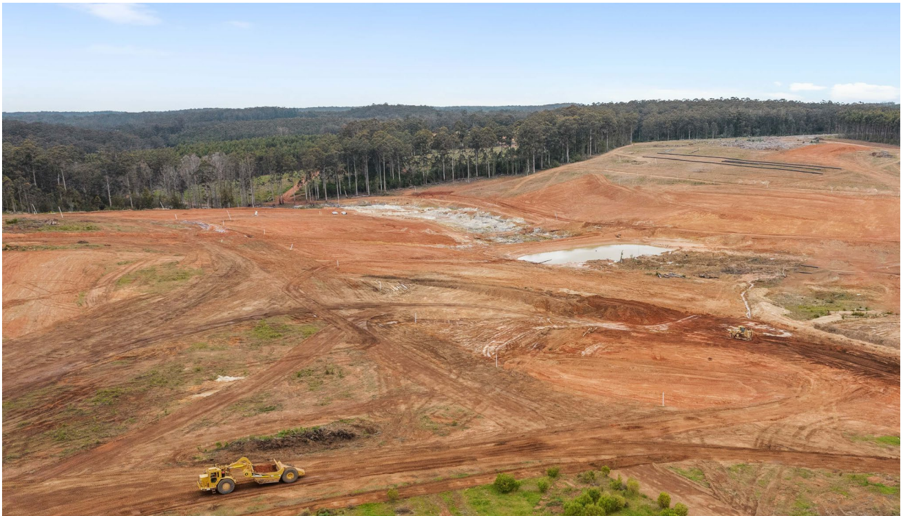
Dam site progresses under landowner construction

The landowner is responsible for all licences and permits in relation to the dam and continues to work closely with regulatory authorities throughout the development process to deliver the water contracted to Alterra under the Carpenters lease agreement.