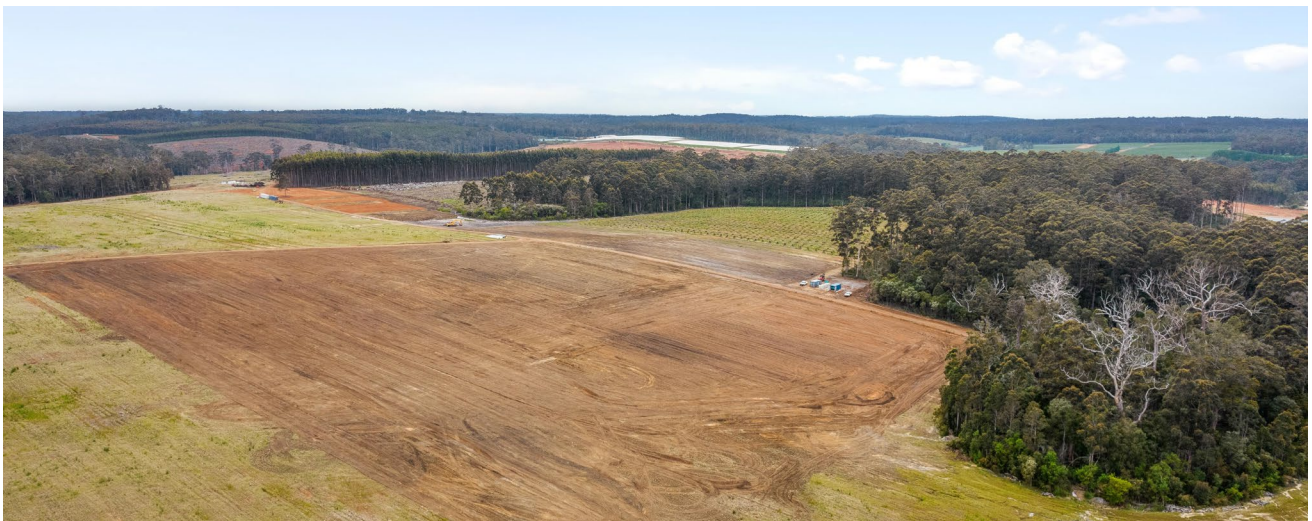
Stage 2 ground preparation

The engagement of Pendulum was made following a request by the Alterra Board for Pendulum to assume a project management role and reflects the outcome of a strategic and operational review conducted by Pendulum and instituted by Alterra's Board of Directors to ensure the Carpenters Project is optimally developed.