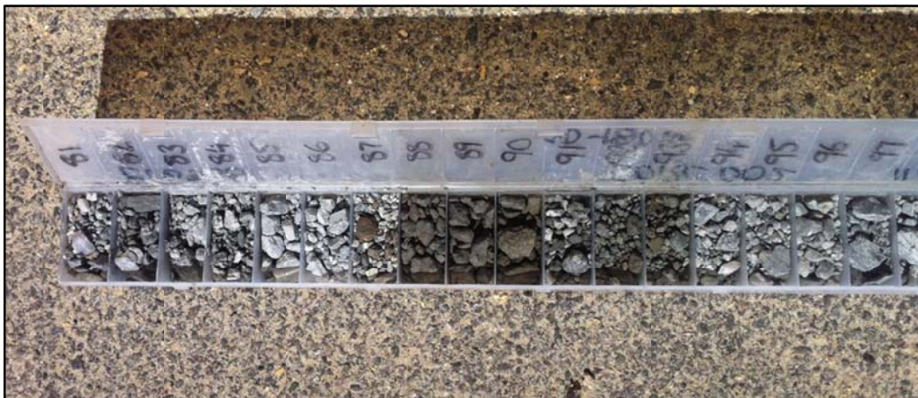
Photo 1: CORC002 RC chips showing disseminated and massive copper sulphides from 80m

Helix Resources Limited (ASX:HLX) is pleased to announce the discovery of a VMS system at its Collerina Prospect in Central NSW. A 1,000m first-pass RC Drilling program, completed during November, has highlighted the presence of VMS-style mineralisation in 7 of the 9 holes (refer Figure 1).