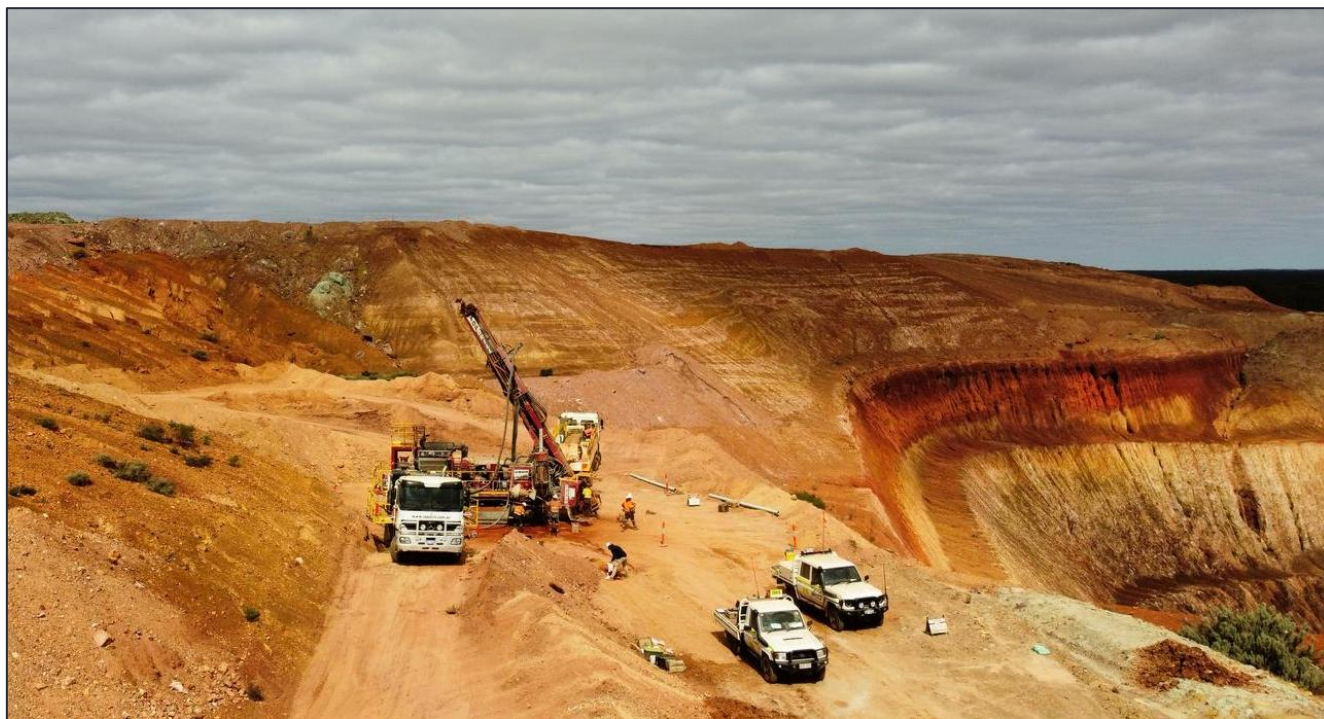
Figure 1 – Drill Rig at the Eureka Gold Project

We look forward to receiving the assays over coming weeks and then using these to help plan our follow up drilling program at the project".