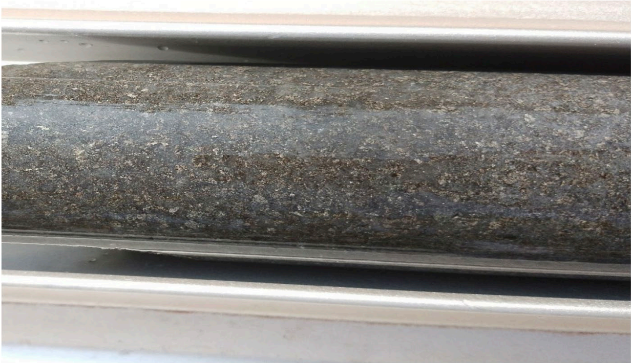
Figure 2: Initial diamond drillhole core showing mafic rock at Liparamba in which disseminated sulphides have been identified at 40m down hole 2 .

A total of nine (9) 150-200m deep DD holes were subsequently drilled along the southern corridor of the Liparamba Nickel Project. The DD program concentrated upon the coincidental anomalies from the AMT and AEM data, as well as recent geological field surveys and older soil surveys.