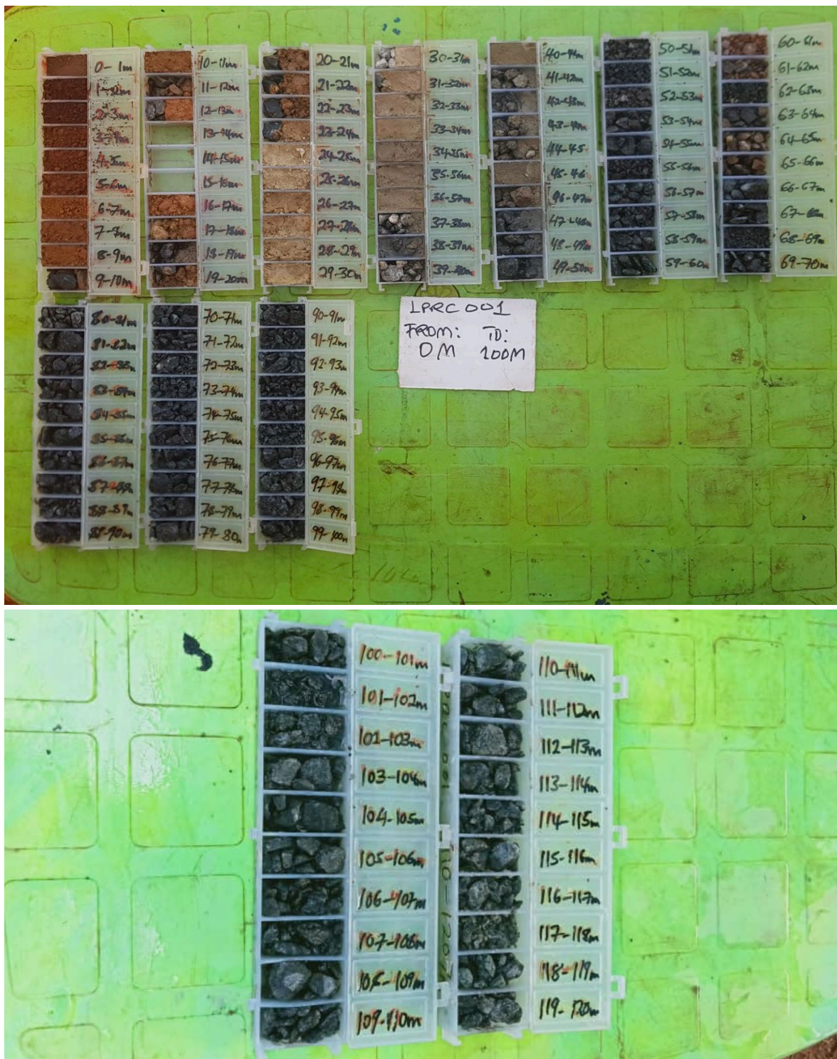
Figures 1: Initial drillhole showing mafic rock at Liparamba in which disseminated sulphides have been identified from 38m to 120m down hole (ended in disseminated sulphides) 3 .

intersect the many Audio-frequency Magnetotellurics ( AMT )/Versatile Time Domain Electromagnetic ( VTEM ) anomalies identified, often within the 100-150m depth range, or if required, to have the ability to drill deeper.