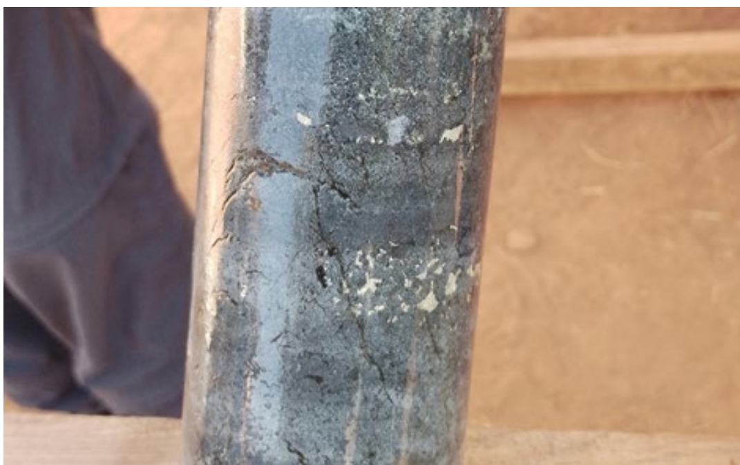
Figure 3: “Blebby” magmatic sulphides noted within drill hole LPDD004

Samples from the Liparamba drill core have been taken for full geochemical analysis and 5 further samples have been collected for petrological test work. Work will continue on the Liparamba project upon review of the assays, and the determination of potential marker element and minerals that can provide a significant series of targets that may define major target areas of potential Ni sulphide mineralisation within the Liparamba mafic inlier.