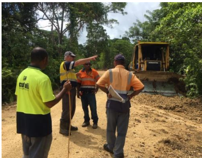
Figure 2: Port Road Clearing

As at 30 Jan 2020, 60% of the plant site has been cleared and grubbed with levelling currently underway. For the port access road, 2.5 km of the 7km has been cleared and forming works are ongoing.