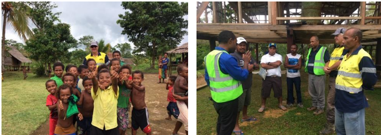
Figure 7: Community consultation and engagement has been extensive and ongoing

Community consultation has been extensive and is ongoing, with detailed planning, preparation and community engagement activities ramping up over the period.