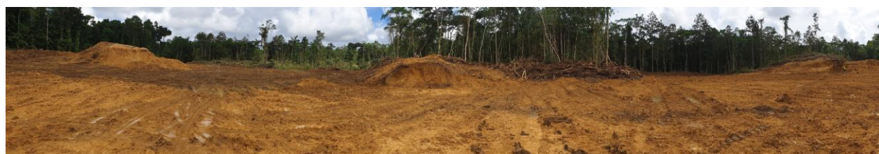
Figure 4: Panoramic photograph of plant clearing, 60% complete as at 30 January 2020