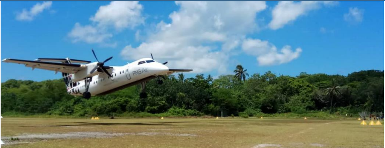
Figure 5: Geopacific personnel arrive on Woodlark Island via PNG Air, the largest aircraft to visit site since World War II.