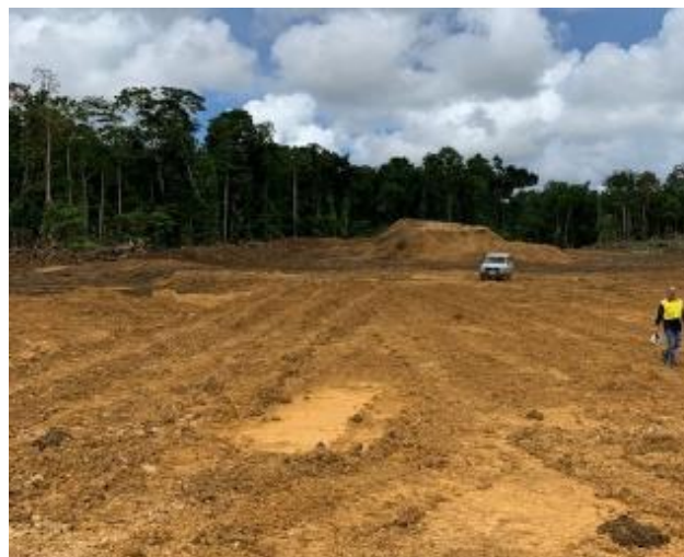
Figure 3: Plant Site Clearing and Grubbing