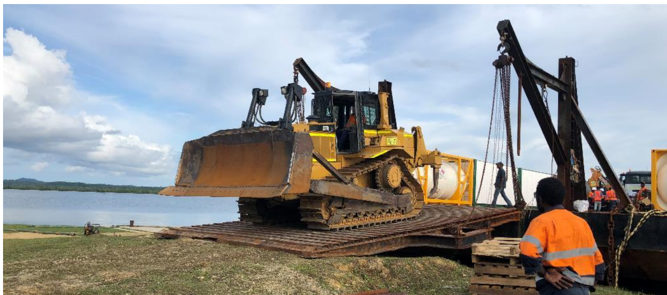
Figure 1: Woodlark Island - Arrival of barge for the commencement of construction and development activities.

Geopacific is now well placed to complete a Civil Works Program designed to facilitate project execution in preparation for the construction of the process plant by GR Engineering”