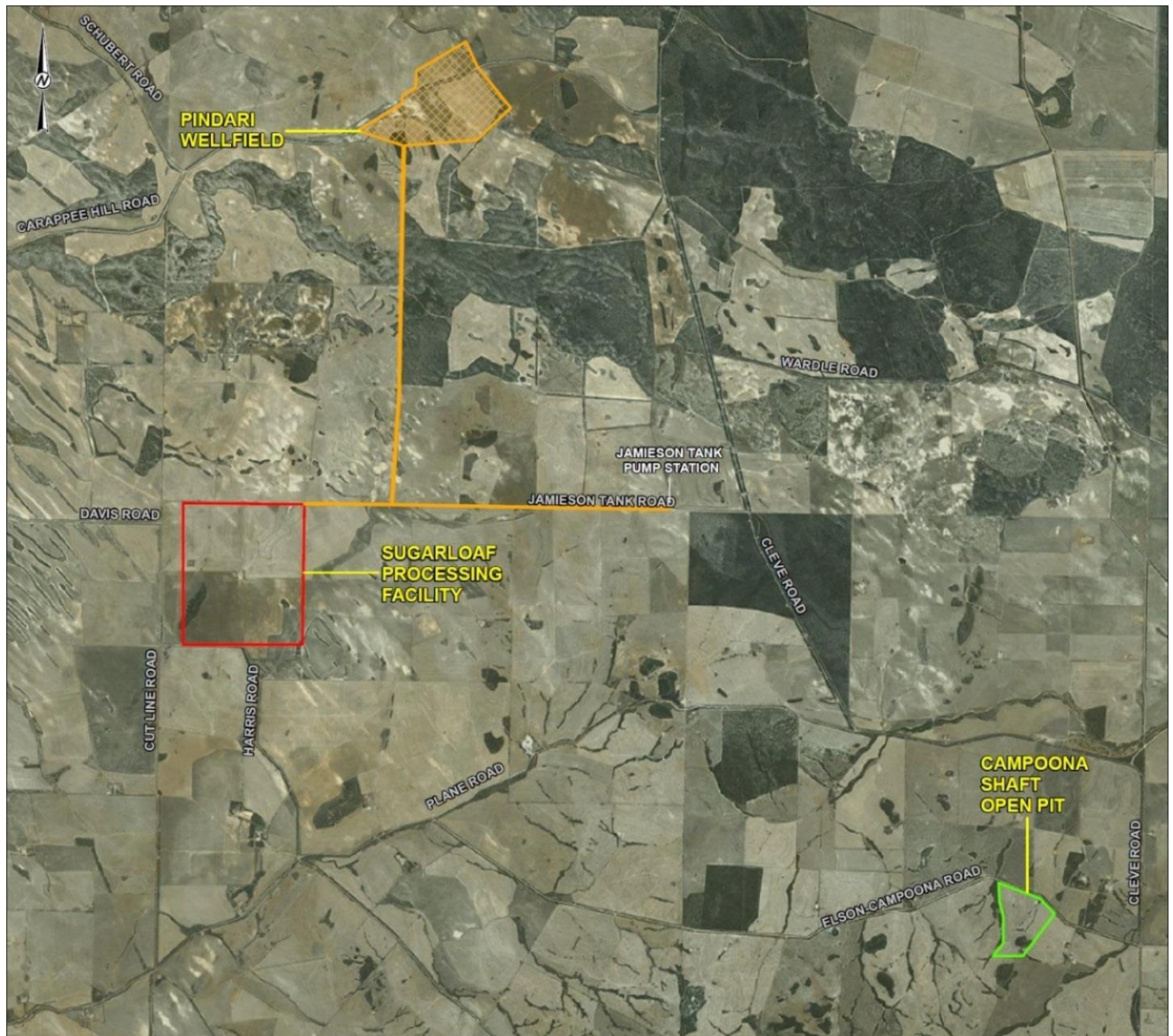
Figure 1: Location of Campoona MLA (green), Sugarloaf Graphite Processing Facility MPL (red) and Pindari Borefield and Pipeline MPL (orange)