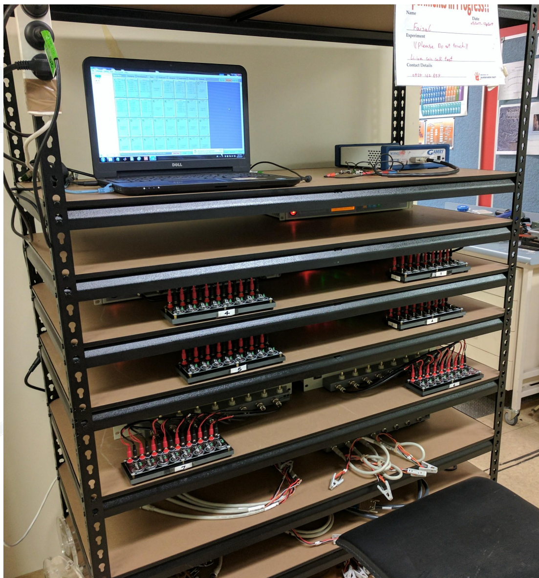
(Figure 3) Hazer's battery analysis equipment within the University of Sydney will leverage cycle rate capability analysis to compare the company's 99.95% synthetic graphite performance against various commercial types of graphite.

In collaboration with The University of Sydney, total discharge capacity, cycle rate capability and cycle life analysis will compare Hazers' 99.95% synthetic graphite performance against various commercial samples of graphite (including spherical coated natural graphite) concurrently assembled into reference coin cells.