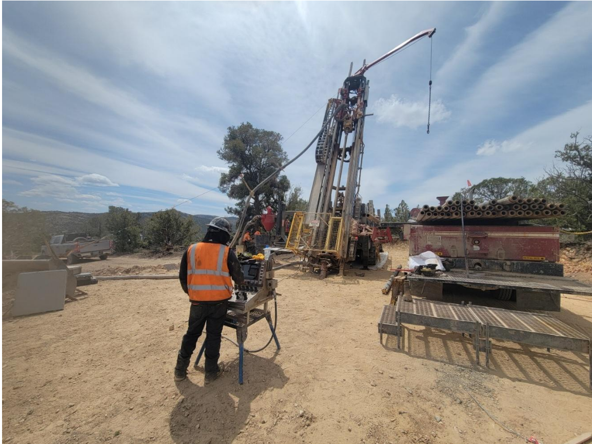
Figure 1 – 2025 Drilling operations at Maverick Springs