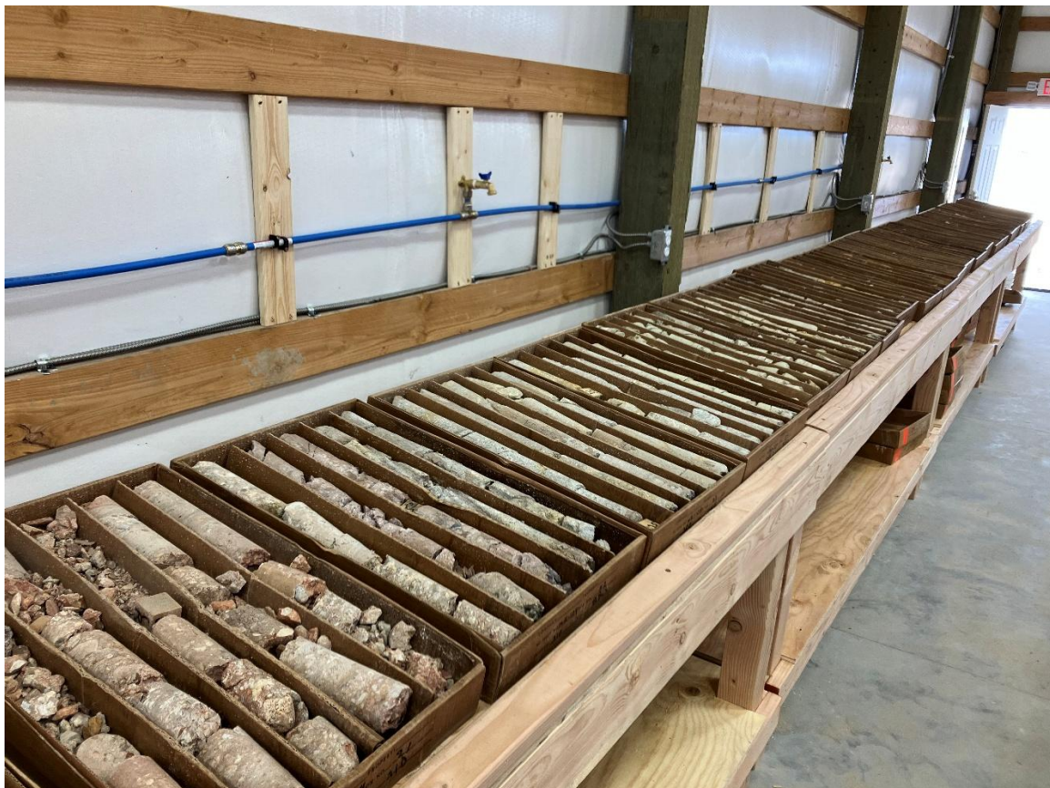
Figure 2 – Sun Silver's Elko core facility