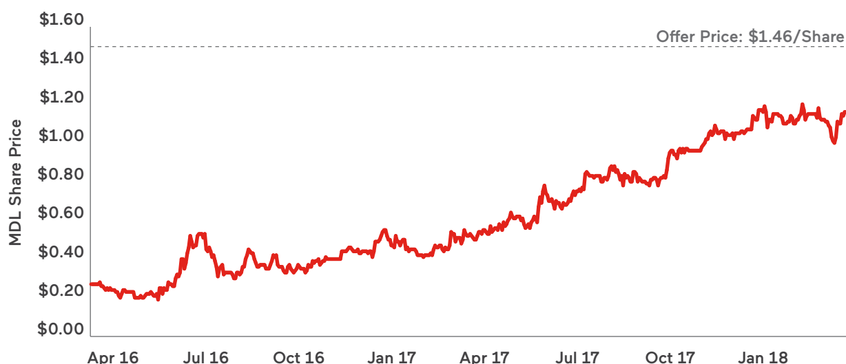
FIGURE 2: MDL HISTORICAL SHARE PRICE PERFORMANCE PRIOR TO THE ANNOUNCEMENT DATE

If the Offer becomes unconditional but ERAMET does not acquire 100% of MDL, then, depending on the circumstances at the relevant time, the liquidity of the Shares may be substantially reduced which would further reduce your ability to readily dispose of Your Shares in the future.