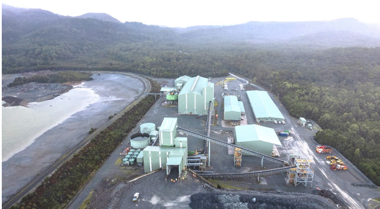
Figure 3. Avebury site overlooking the ROM pad.

Mining operations have commenced at Avebury. Ore is being delivered to the ROM pad where a stockpile is being developed in advance of commissioning the processing plant, which is planned to commence operations this year.