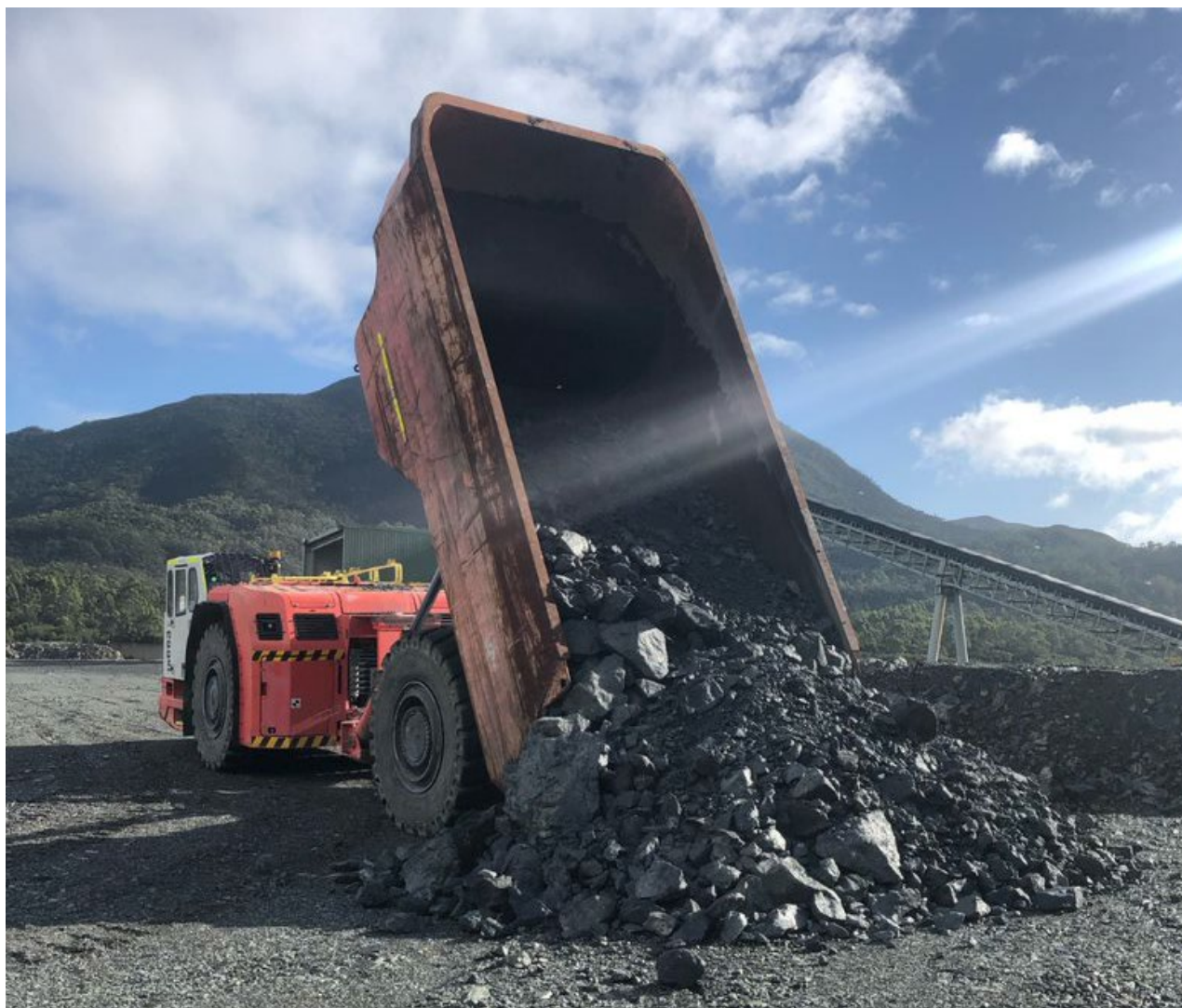
Figure 2. First ore from underground mine delivered to the ROM pad.

The June quarter was a transformative and exceptionally active period for Mallee Resources Limited (“MYL” or “the Company”). In early July, the Company acquired Allegiance Mining Pty Ltd (“Allegiance”) which holds the Avebury nickel project in western Tasmania, following shareholder approval for the transaction obtained on 29 June 2022. Key commercial agreements customised for Avebury were entered into with Hartree, setting strong foundations for an enduring commercial relationship. Mining operations also began in May with underground ore being delivered to the run-of-mine (“ROM”) pad in advance of the commissioning the processing plant.