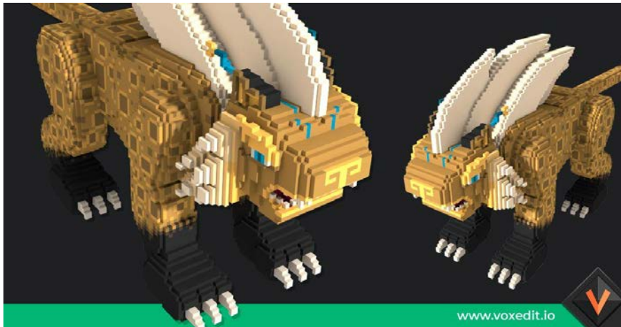
Example of Voxel Assets