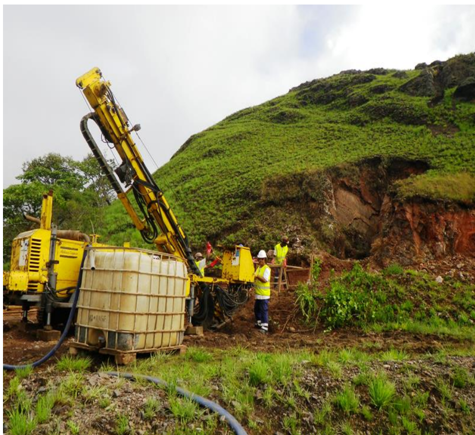
Figure 1: Drilling at Cassenha Hill - November 2015

The Directors of Rift Valley Resources (the Company) are pleased to announce that diamond drilling has commenced at the Cassenha Hill prospect, within the Catabola area of its 70% owned Ozango Project - Angola