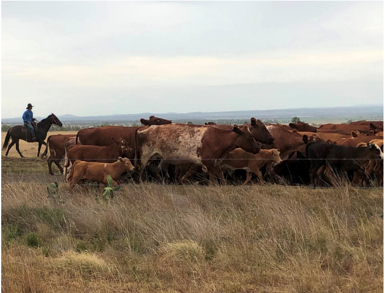
Figure 1: Mustering cows and calves, (Acland Pastoral)

The pasture management strategy, which includes use of rehabilitation areas for grazing, is ongoing.