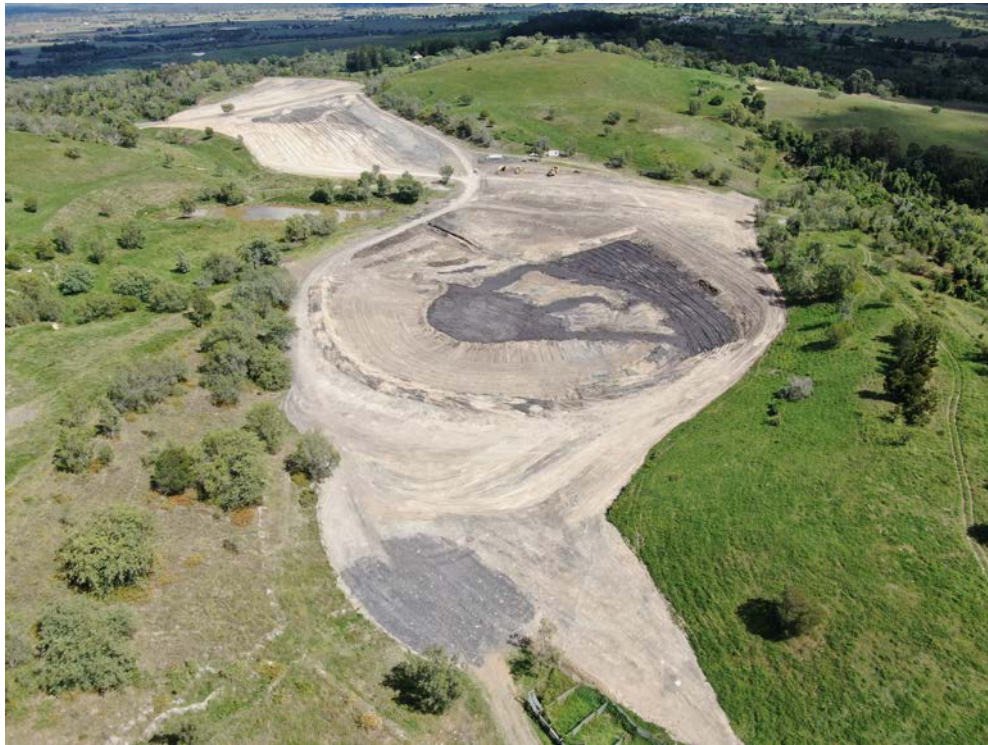
Oakleigh East showing ongoing rehabilitation and capping of a tailings dam area. Images taken from the north-east

Oakleigh East rehabilitation activities have continued during the quarter with the capping of remnant tailing dams nearing completion.