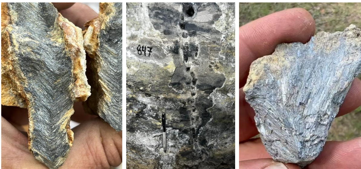
Figure 1: View of the Antimony Canyon Project area (looking northwest). Samples from within the Canyon for illustrative purposes only in support of field observations. No assays are available.