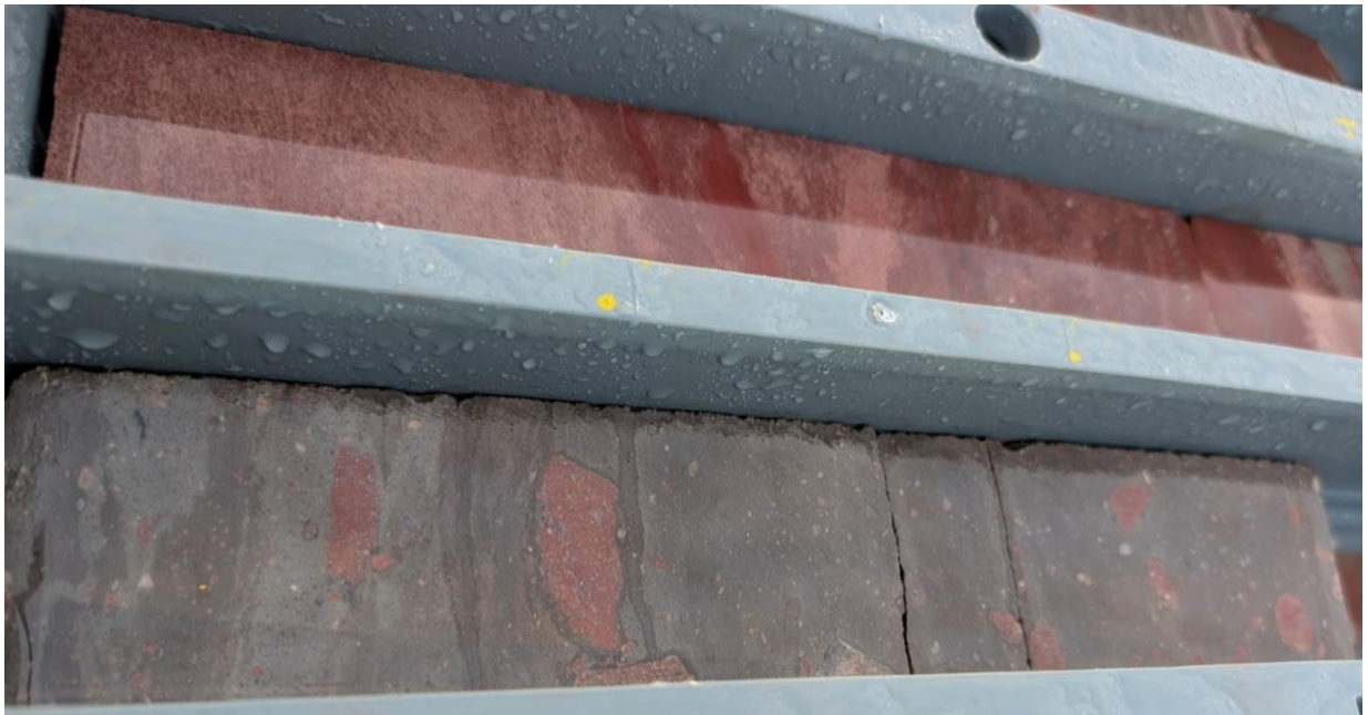
Figure 2 Reducing black mud supported conglomerate in drillhole DD25EB0038, moderately mineralised with disseminated chalcocite (see below Appendix 1 for more details and logging).