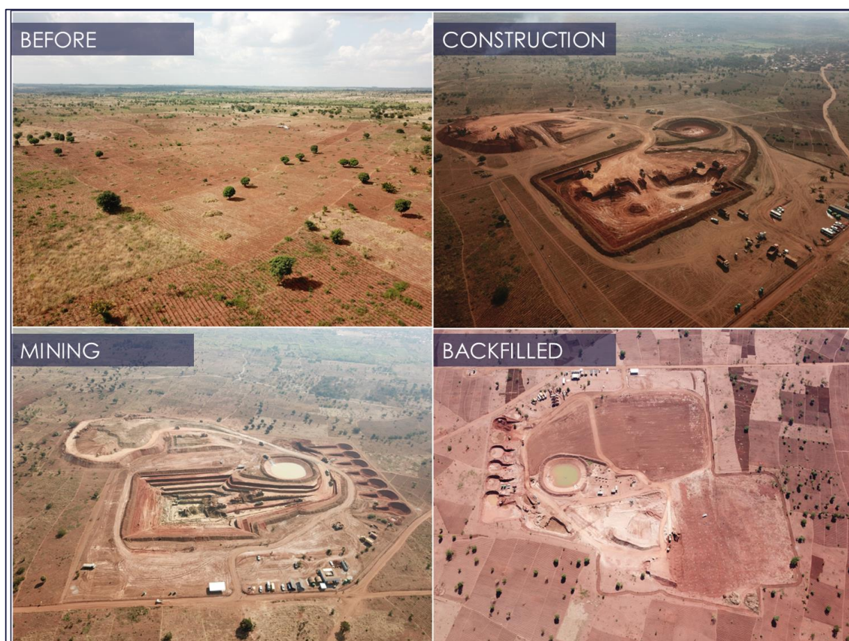
Figures 2-5: Stages of test pit mining and backfilling

During the Pilot Phase mining trials, 170,000m 3 was mined using a conventional excavator fleet. The fleet was used to place mined material back into the pit, filling the pit to the original ground level in less than two months and ahead of schedule.