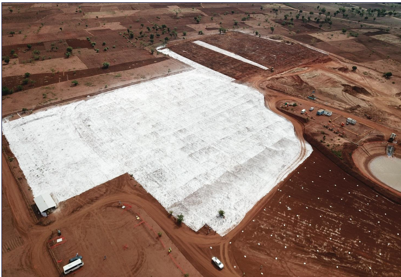
Figure 6: Introduction of lime at the backfilled test pit