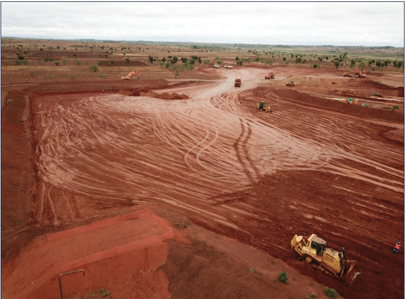
Figure 1: Test pit backfilling