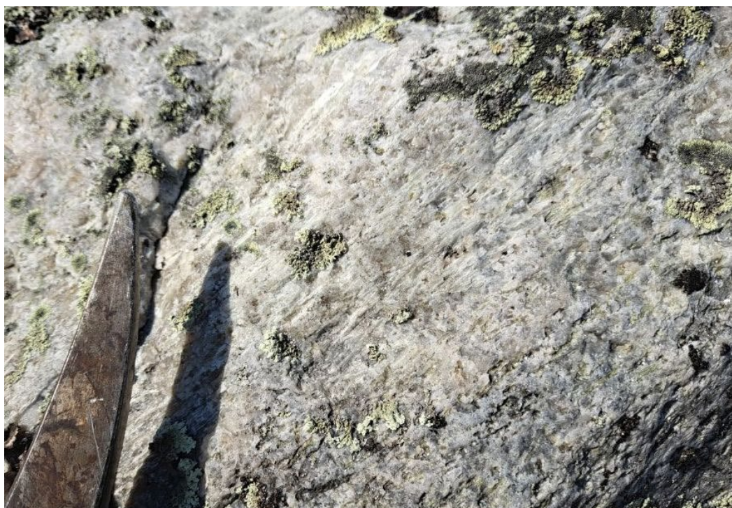
Figure 4: Abundant fine-medium grained Spodumene, Central YLP