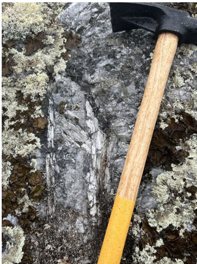
Figure 3: White Spodumene, Northern YLP