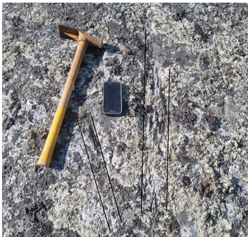
Figure 2: Coarse Spodumene, South Eastern YLP