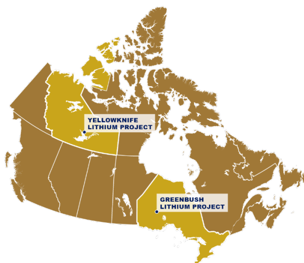
Midas Minerals Canadian Projects Location Map

Newington Lithium-Gold Project: 316km 2 of tenements located at the north end of the Southern Cross and Westonia greenstone belts, prospective for lithium and gold. Exploration in 2022 has outlined anomalous lithium and LCT indicator elements over at least 20km strike. Initial drilling intercepted pegmatites that are laterally extensive, wide and gently dipping. The project also has a number of gold targets and includes significant prior drill intercepts that justify follow-up exploration.