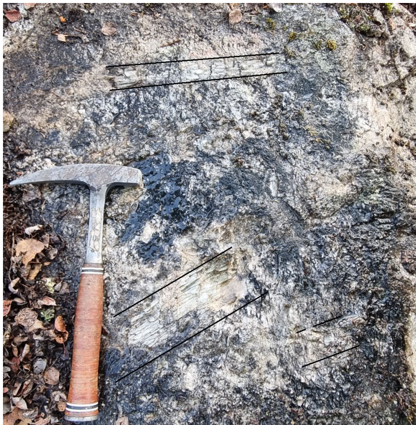
Figure 1: Coarse Spodumene in Pegmatite, Central Southern YLP