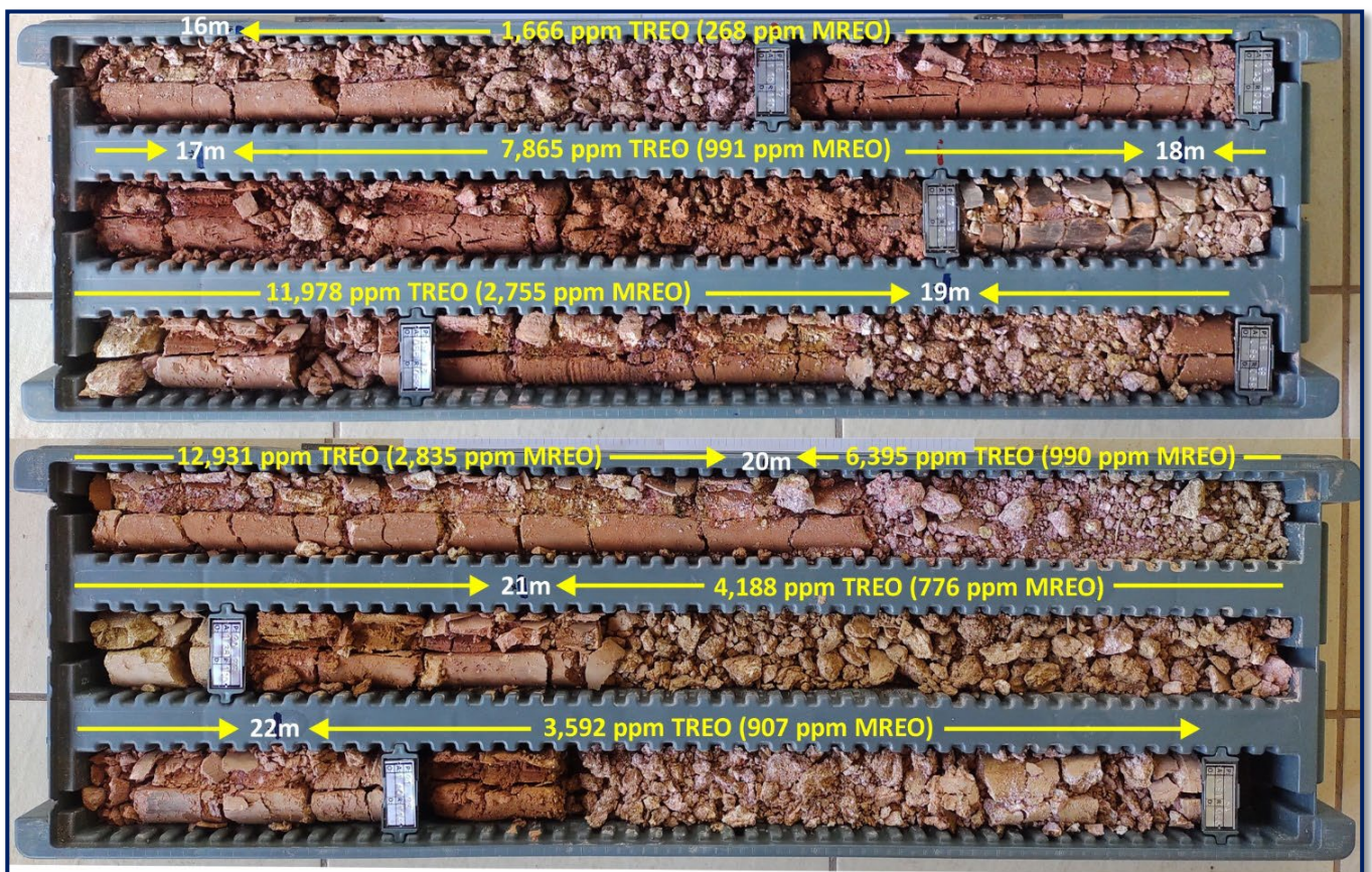
Figure 1 - CLD-DDH-001 high grade zone

The results include outstanding shallow, high-grade Total Rare Earth Oxide ( TREO ) intercepts up to 12,931ppm TREO ( CLD-DDH-001 ). The initial assays highlight the Project’s significant REE mineralisation potential, with extensive lateral continuity of thick high-grade intersections from the diamond drill hole. This underscores the potential for the Caladão Project to emerge into a major REE discovery in Brazil.