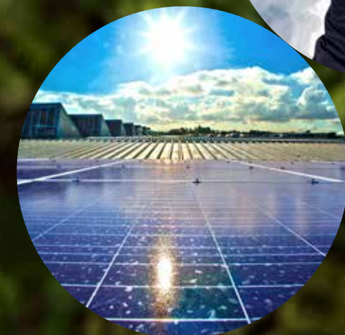
< AIR NEW ZEALAND HAS THE COUNTRY'S LARGEST SINGLE SOLAR ARRAY LOCATED AT OUR AUCKLAND TECHNICAL OPERATIONS BASE