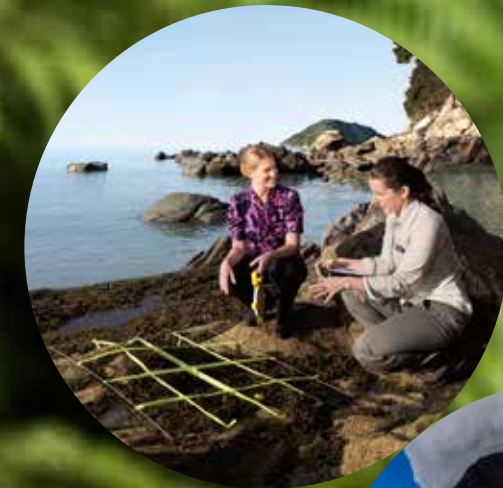
< SUPPORTING THE DEPARTMENT OF CONSERVATION'S MONITORING OF NEW ZEALAND'S MARINE RESERVES

Through our partnership with Antarctica New Zealand we have supported science research projects on the ice. We have also helped raise awareness of the significance of Antarctica and the importance of the work that New Zealand scientists are doing there.