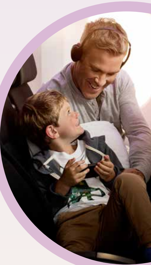
Christopher Luxon Chief Executive Officer