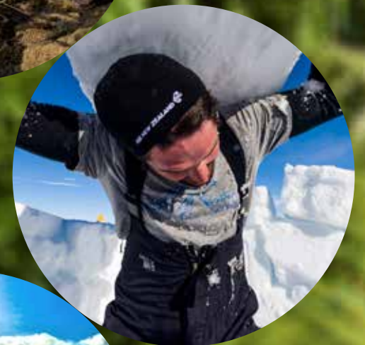
PARTNERING ANTARCTICA > NEW ZEALAND'S CLIMATE SCIENCE PROJECTS ON THE ICE