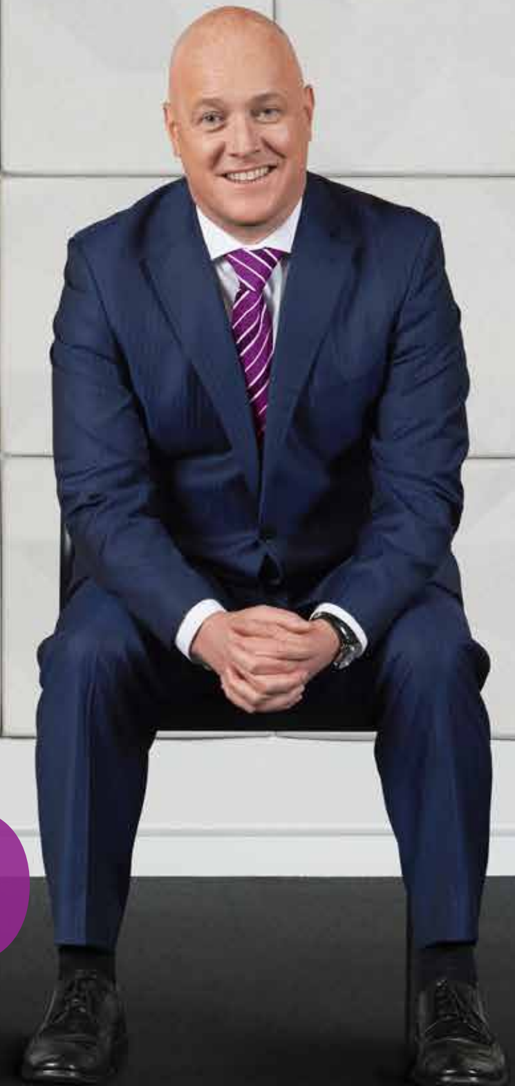
CHRISTOPHER LUXON | CHIEF EXECUTIVE OFFICER

Our success is underpinned by hard work and tough decisions undertaken in recent years. We have strong foundations in place and we are ready to keep driving forward and further improve our performance.