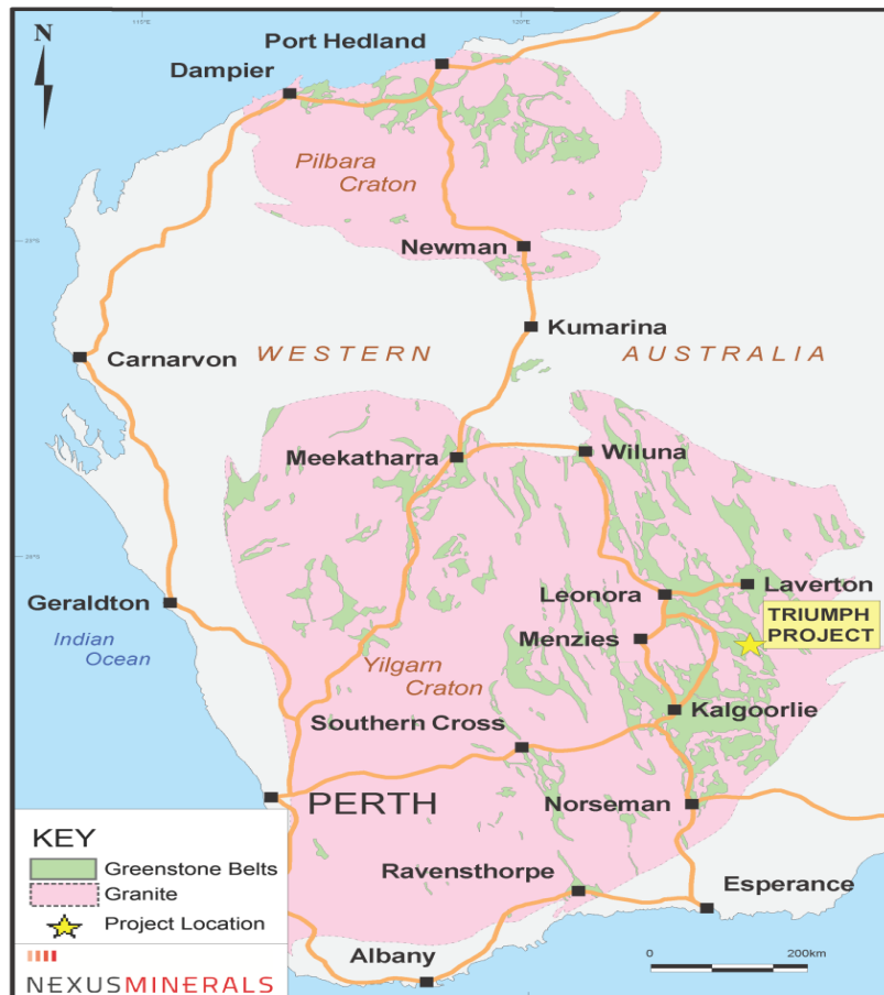
Figure 1. Triumph Project location, Western Australia.

Detailed due diligence on the Triumph Gold Project culminated in the farm-in and joint venture agreement being finalised and the agreement announced on 15 October 2014 (see ASX release). The Triumph Project is located in the Eastern Goldfields of Western Australia, some 145km northeast of Kalgoorlie (figures 1 and 2).