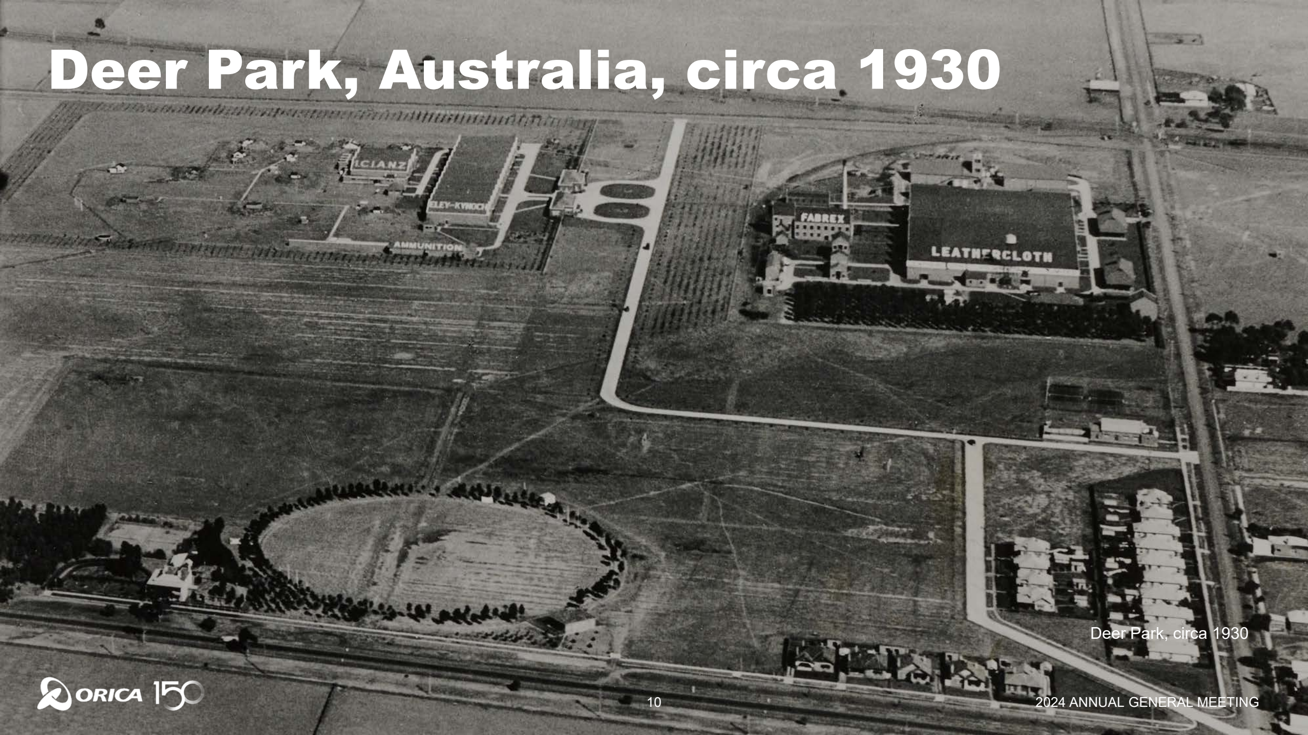
Deer Park, circa 1930