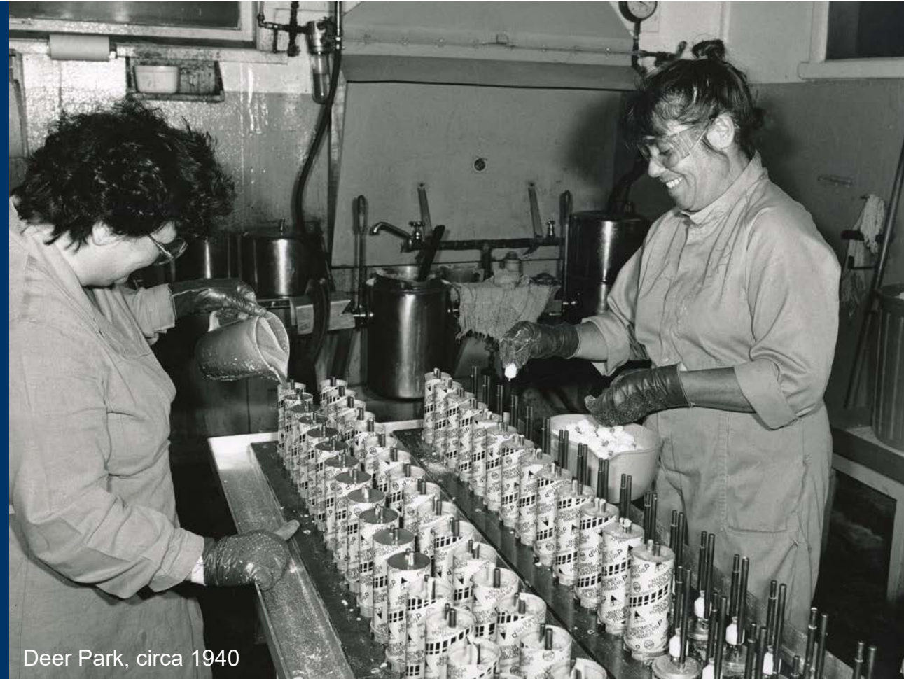
Deer Park, circa 1940