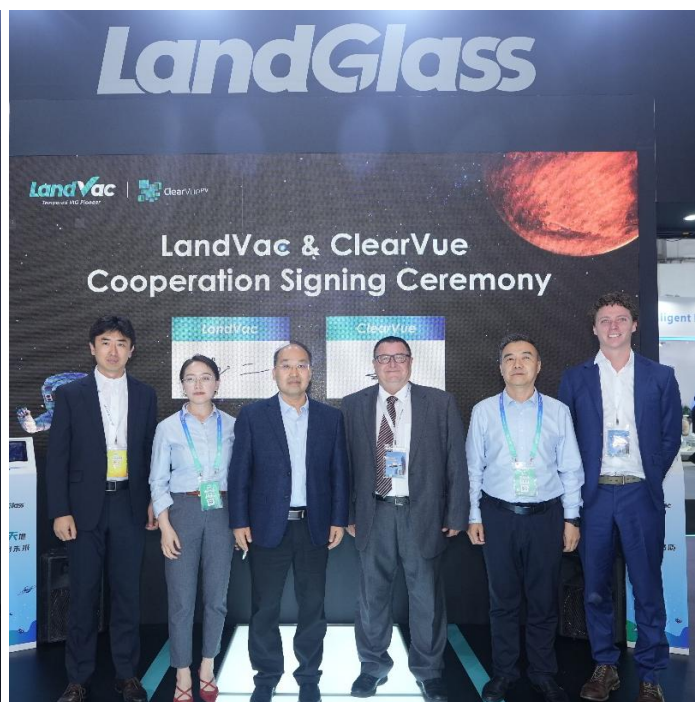
LandGlass Group & ClearVue Leadership