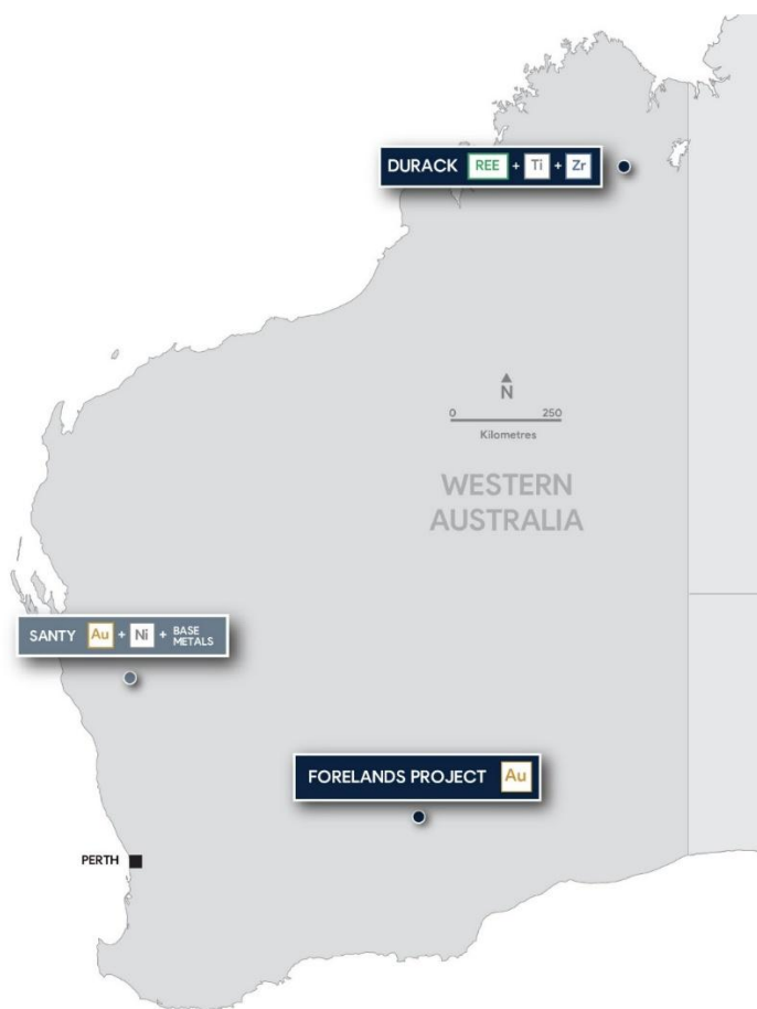
Fig. 2 - BPM Minerals Western Australian Projects

The management and exploration teams are well supported by an experienced Board of Directors who have a strong record of funding and undertaking exploration activities which have resulted in the discovery of globally significant deposits both locally and internationally.