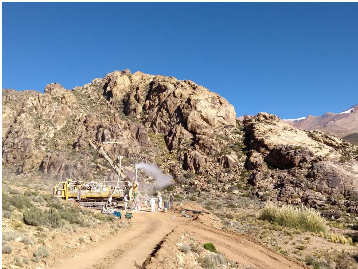
Photo 7. Drilling underway at the La Opeñas Gold Project. Hole LORC19-08 at the Tramway Target vein.