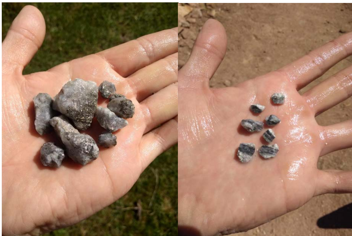
Photo 1 (left): Hole LORC19-01, Rock Oven Target vein. Crystalline quartz with pyrite, sphalerite and arsenopyrite, some argillic alteration. Photo 2 (right): Hole LORC19-02, Rock Oven Target vein. Sulfide banded veinlets: pyrite, sphalerite, black silica banded.