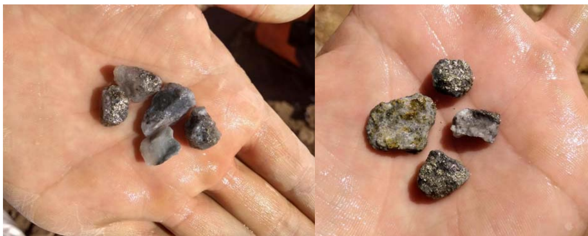
Photo 3 (left): Hole LORC19-03, Rock Oven Target vein. Crystalline and chalcedonic quartz, with some banded chalcedonic quartz: pyrite sphalerite, black silica. Photo 4 (right): Hole LORC19-03, Rock Oven Target vein. Massive sulfides: pyrite, arsenopyrite, sphalerite, jarosite, some chalcopryrite.