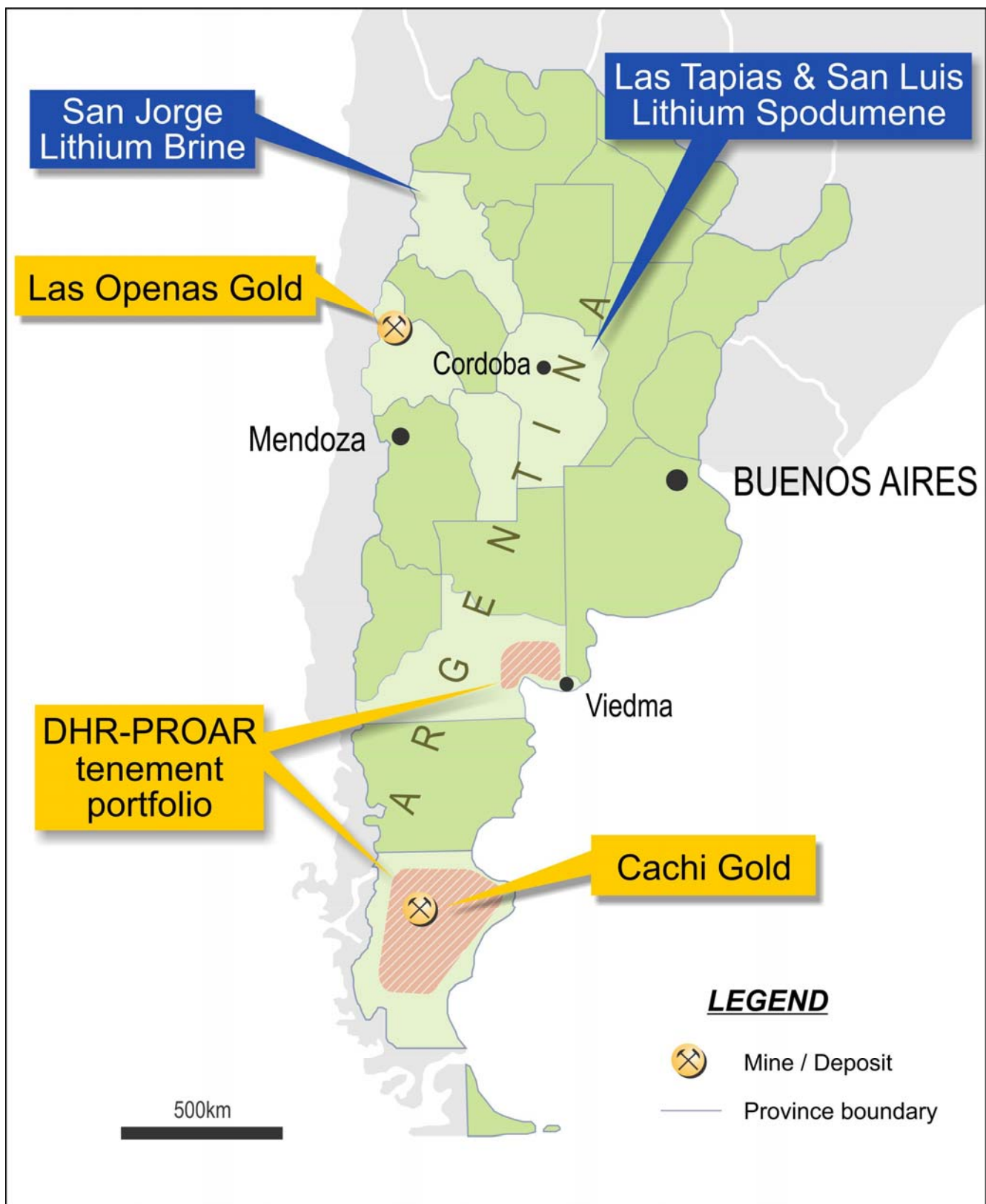
Figure 1. Location of the Dark Horse's Argentina mineral projects.