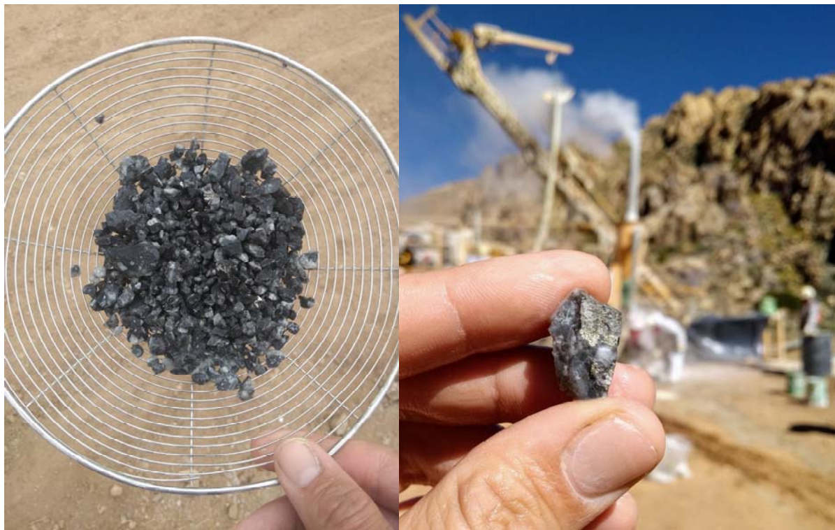
Photo 5 (left): LORC19-07, Tramway Target vein. Sulfides in chalcedonic quartz vein-breccia: pyrite, sphalerite, arsenopyrite. Photo 6 (right): LORC19-07, Tramway Target vein. Chalcedonic quartz vein with some brecciation: red sphalerite, pyrite, some chalcopyrite.